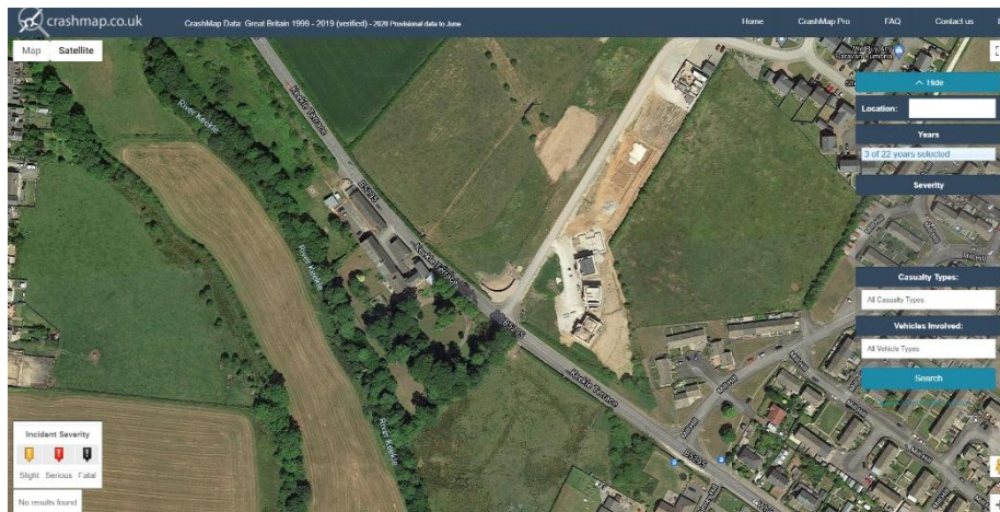
Extract 1: Crashmap – Recorded Personal Injury Accidents 2018-2020

The road safety performance of the existing junction has been assessed using Crashmap for the three-year period 2018 to 2020 and an extract is shown below.