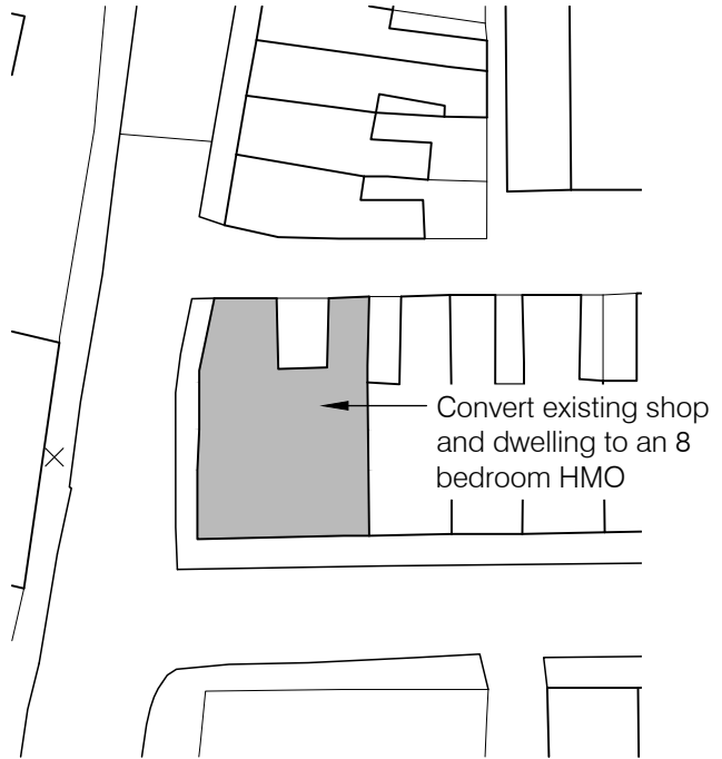
PROPOSED BLOCK PLAN - 1:500