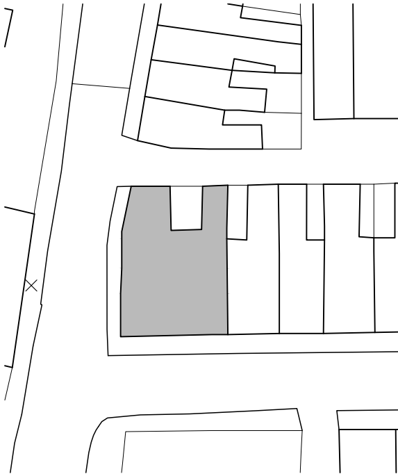
EXISTING BLOCK PLAN - 1:500