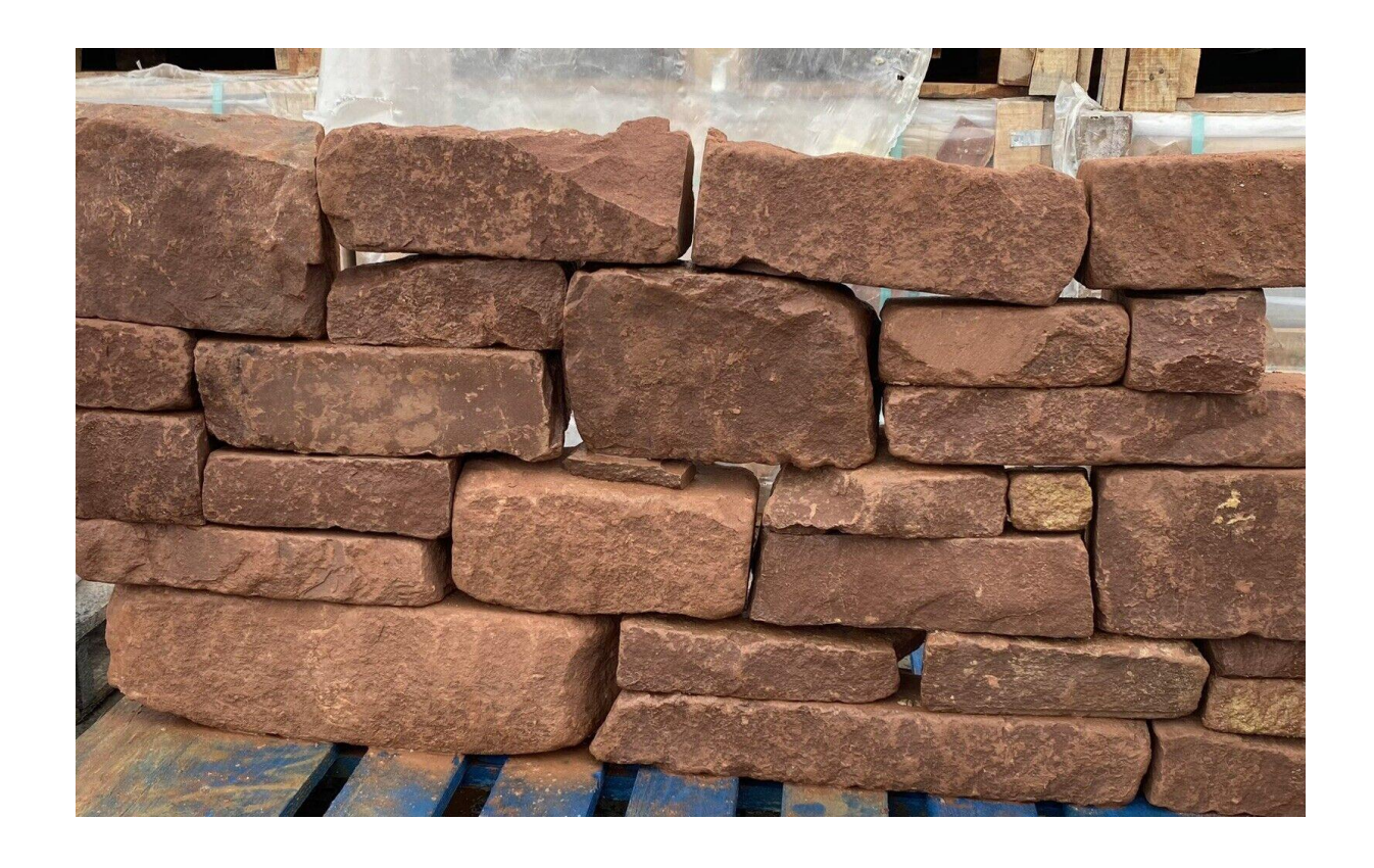
ST. BEES RED SANDSTONE

https://cumbrianstone.co.uk/st-bees-sandstone/