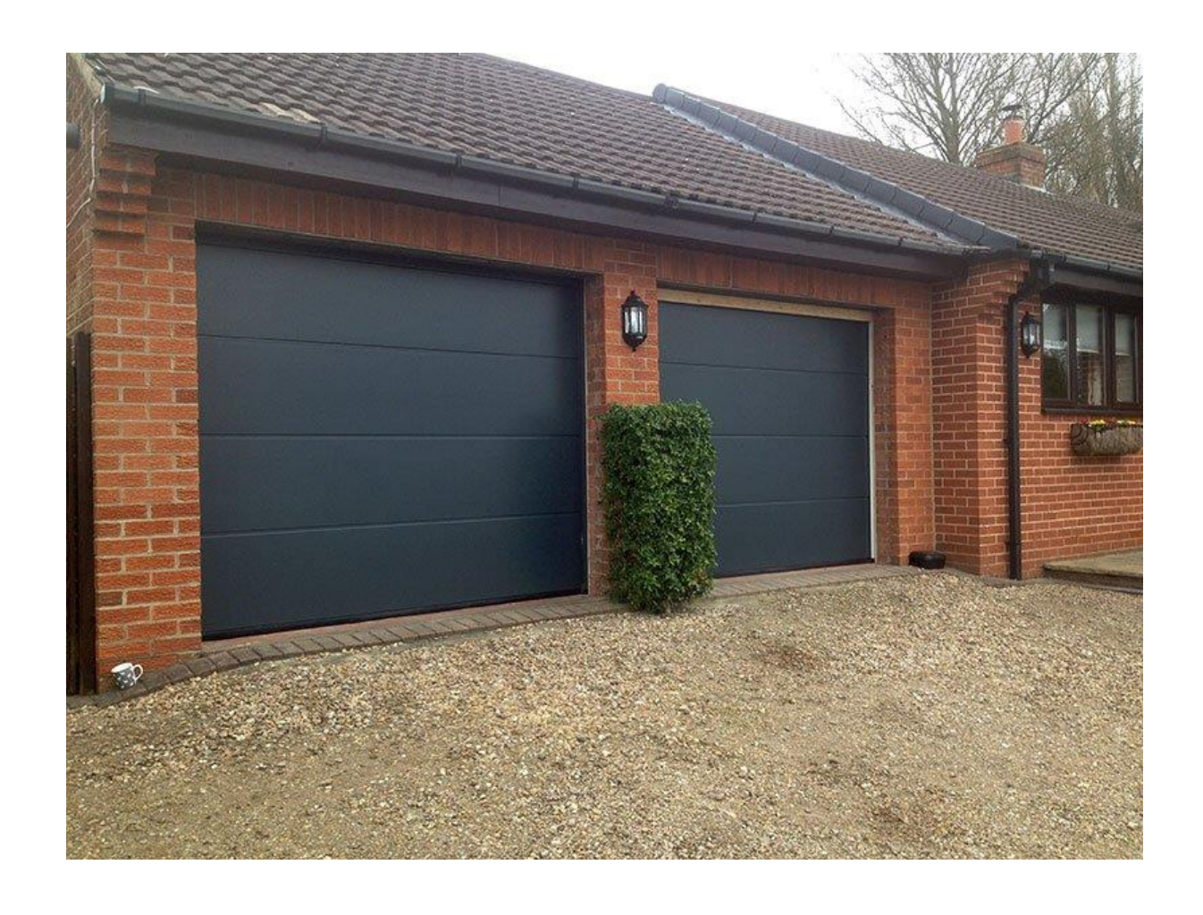
HORMANN SECTIONAL GARAGE DOORS POLYESTER COATED IN ANTHRACITE GREY <a href="https://www.garagedoorsonline.co.uk/cataloguedetails/Hormann-2602-Finesse-Stock-Sizes-(Anthracite-Grey)-Up-and-over-garage-door-Steel-Hormann/g/1987">https://www.garagedoorsonline.co.uk/cataloguedetails/Hormann-2602-Finesse-Stock-Sizes-(Anthracite-Grey)-Up-and-over-garage-door-Steel-Hormann/g/1987</a>