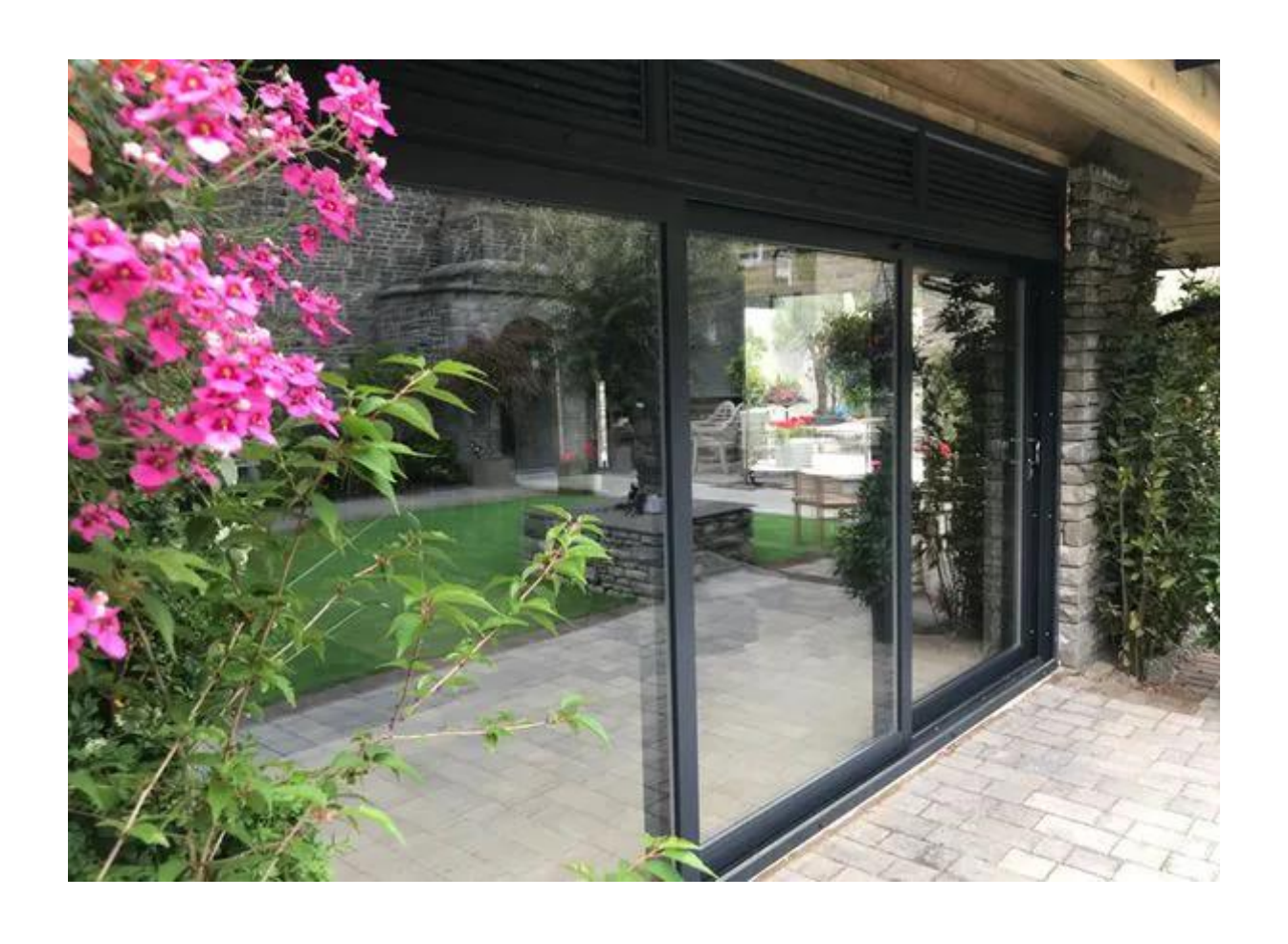
REHAU uPVC DOORS IN ANTHRACITE GREY <a href="https://window.rehau.com/uk-en/agila-sliding-doors">https://window.rehau.com/uk-en/agila-sliding-doors</a>