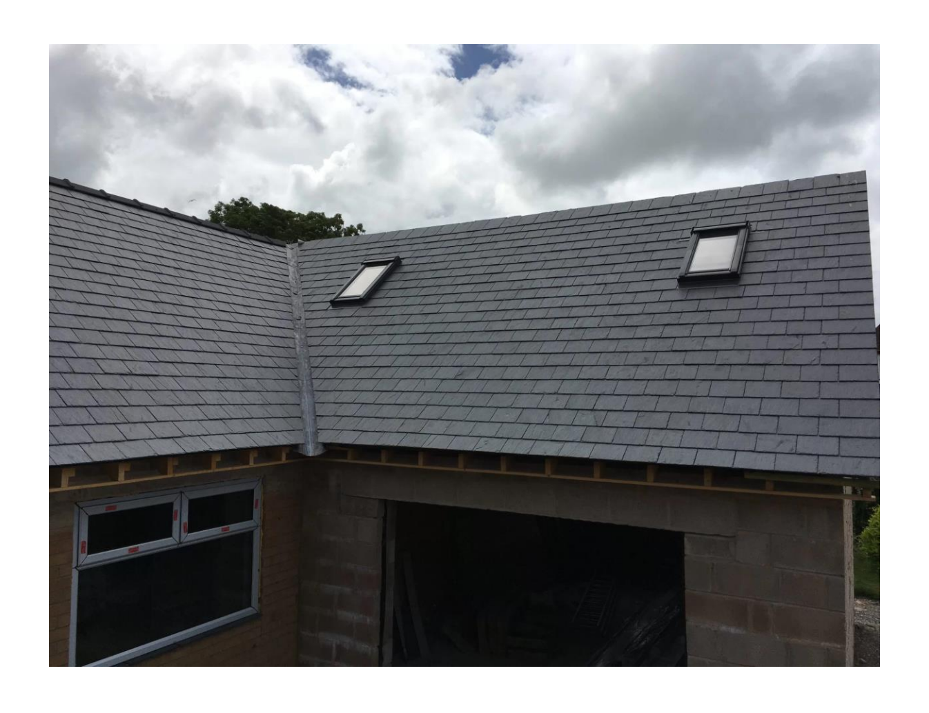
UK SLATE – ESTILLO 29 – BLUE/ BLACK https://www.ukslate.com/product/productestillo-29-blue-black/