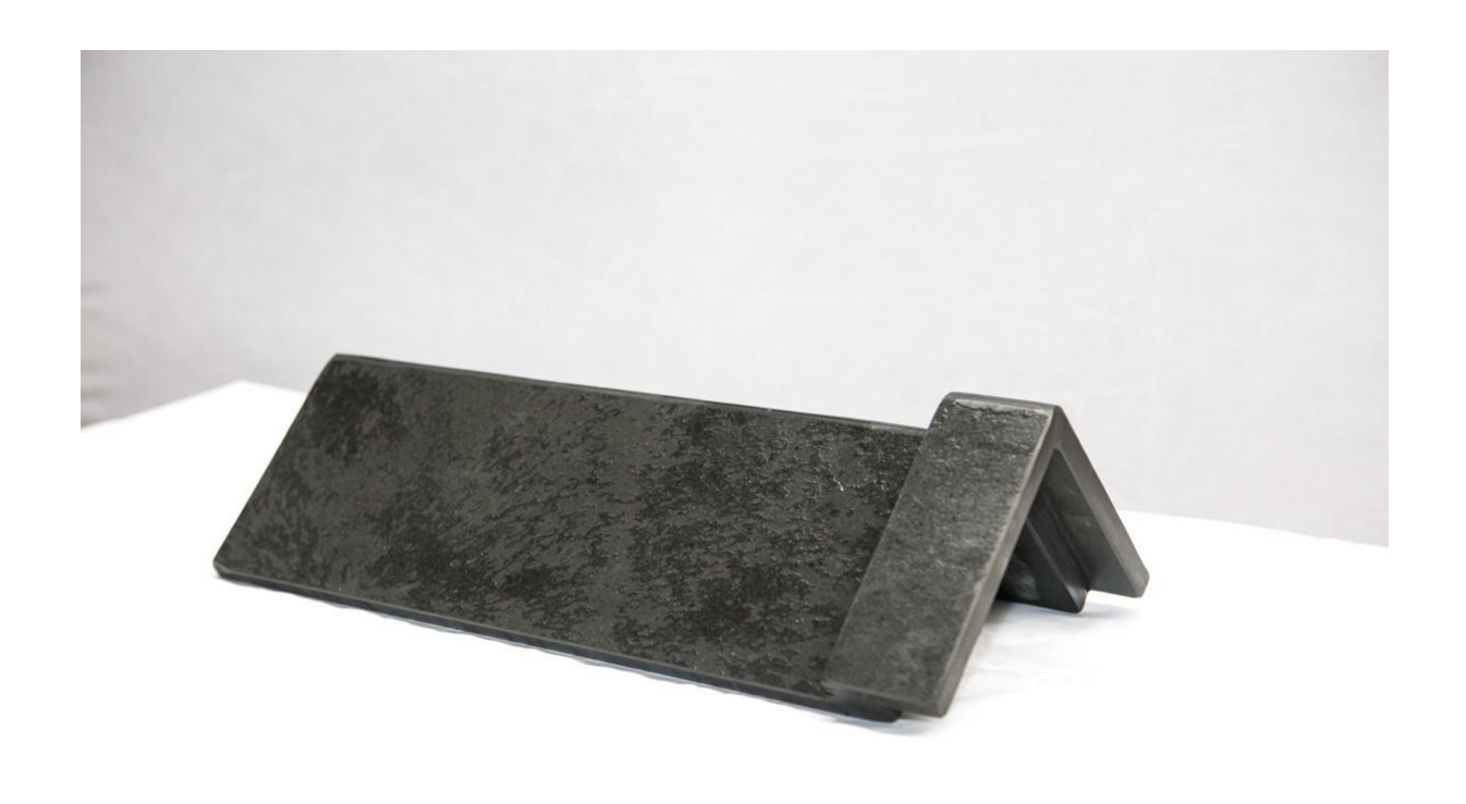
UK SLATE – GRAPHITE CAPPED SLATE RIDGE

https://www.ukslate.com/product/graphite-capped-slate-ridge/