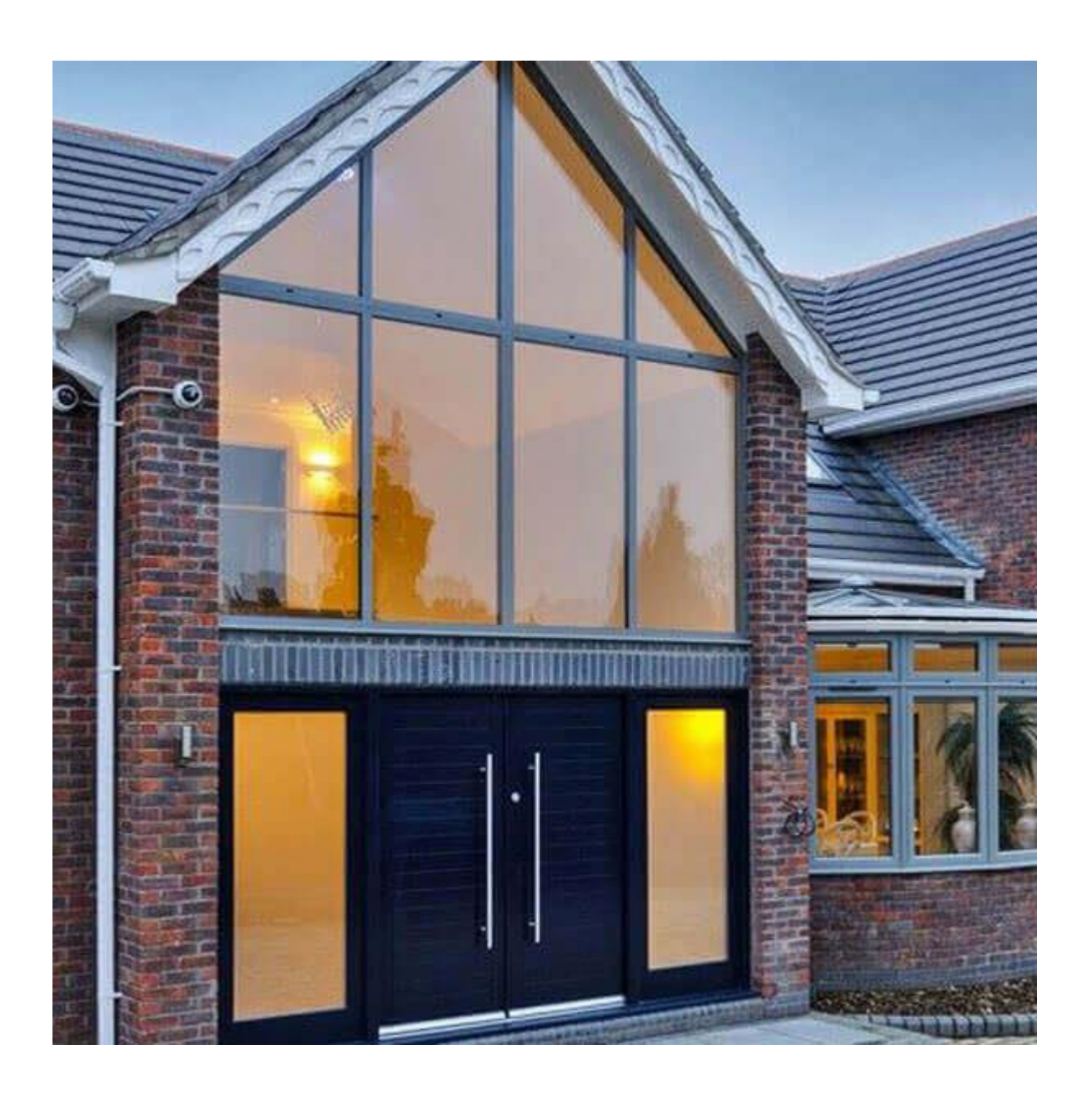
EXAMPLE OF GLAZED GABLE FRAME WITH SOLID DOOR

(Note: glazed gable frames are purpose made from individual components so it is not possible to provide a manufacturer's link).