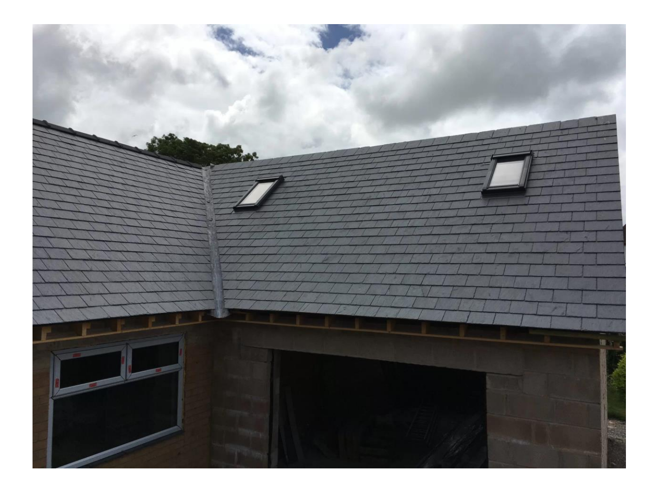
UK SLATE – ESTILLO 29 – BLUE/ BLACK https://www.ukslate.com/product/productestillo-29-blue-black/