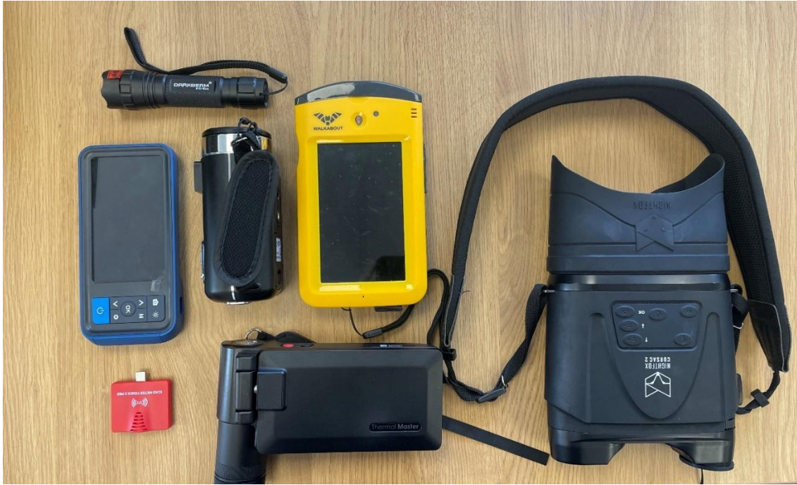
Figure 2 – The equipment used on site.