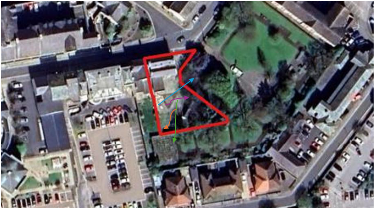
Figure 5 – Map depicting flight lines of observed bat species