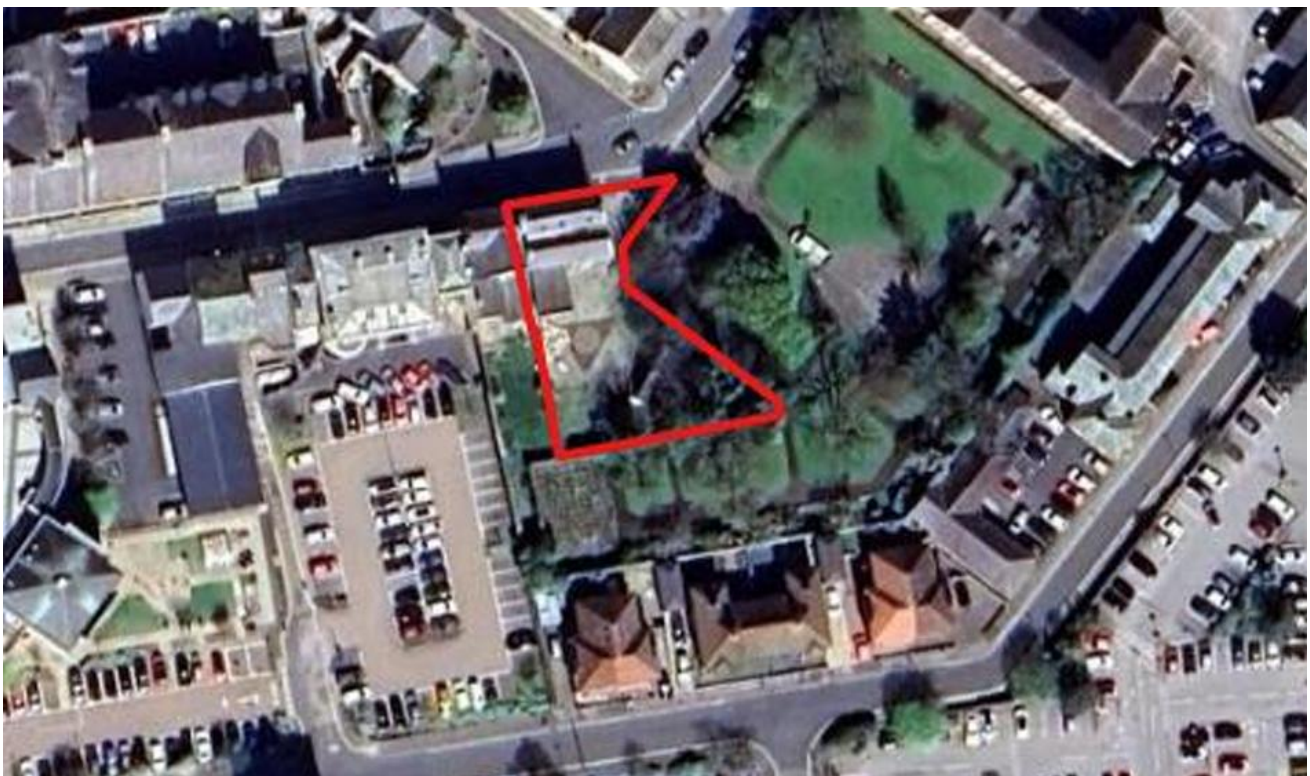
Figure 1 – The site layout

The site is located at 17 Irish Street, Whitehaven, Cumbria, CA28 7BU (grid reference: NX 97328 17922). It is approximately 850 metres squared in size and comprises of building surveyed (B1) (See Figure 1).