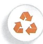
Material PP - Aluminium Stainless steel (100% Recyclable)