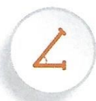
Slope 12° to 50°