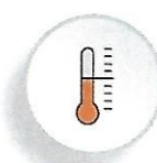
Temperature range -30°C to 100°C