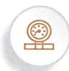
Weight 2.8 to 3.7 kg/m²