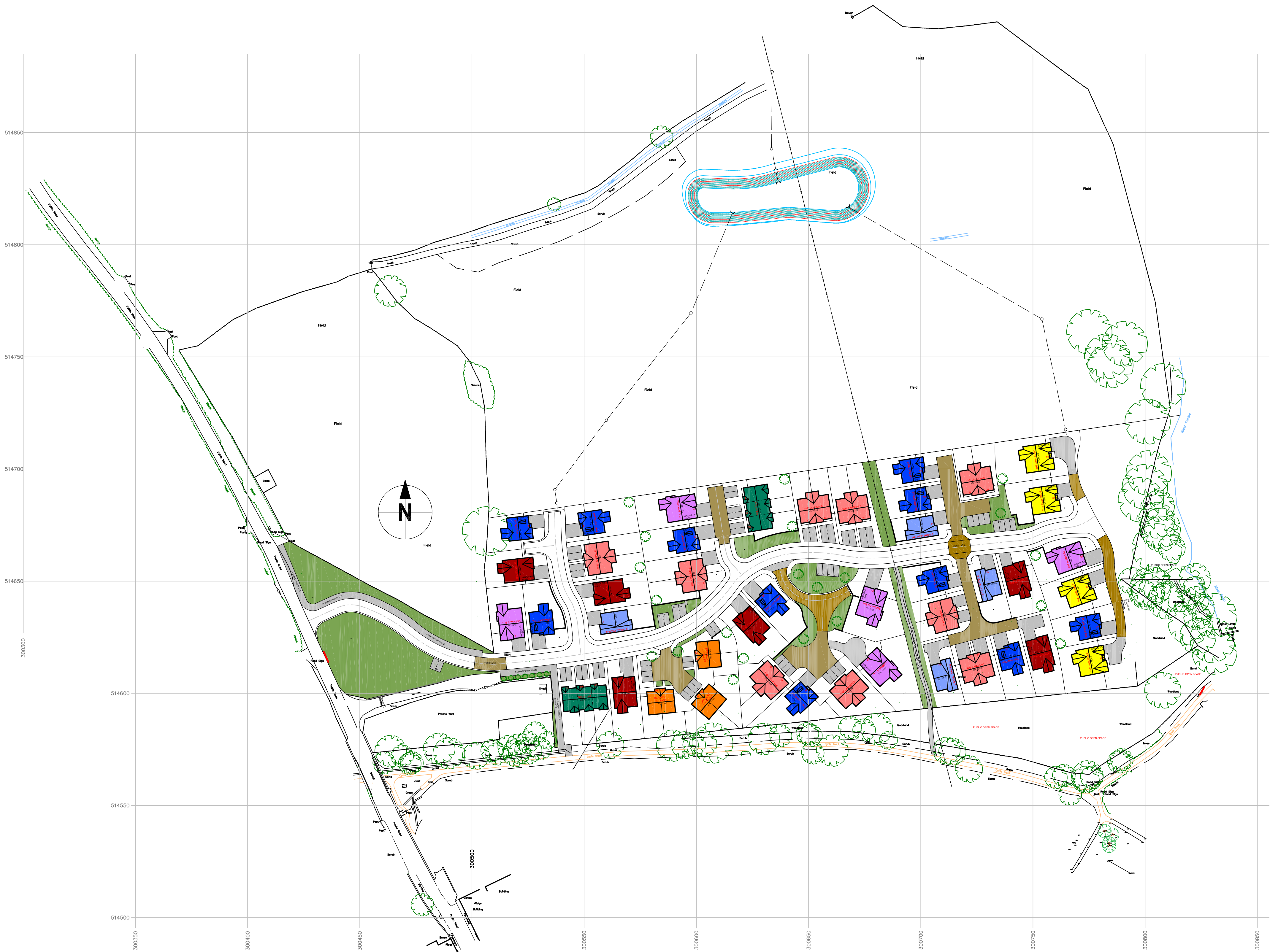
LEGEND - DWELLING TYPES (60 no. TOTAL)