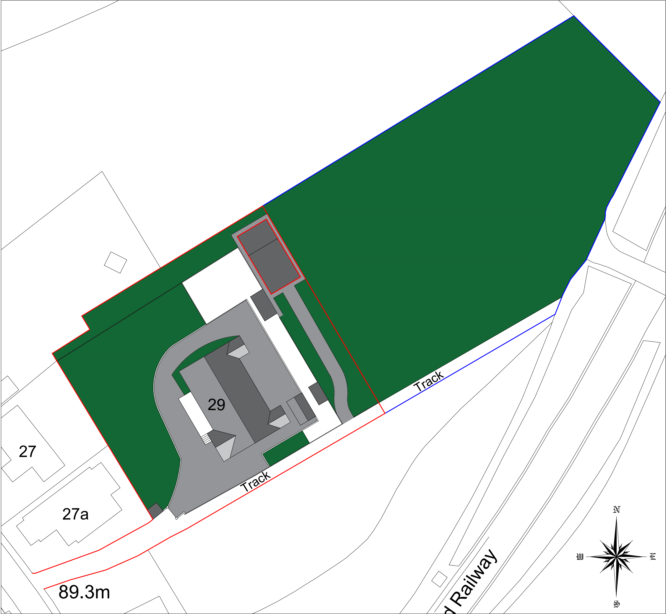
Block Plan 1/500