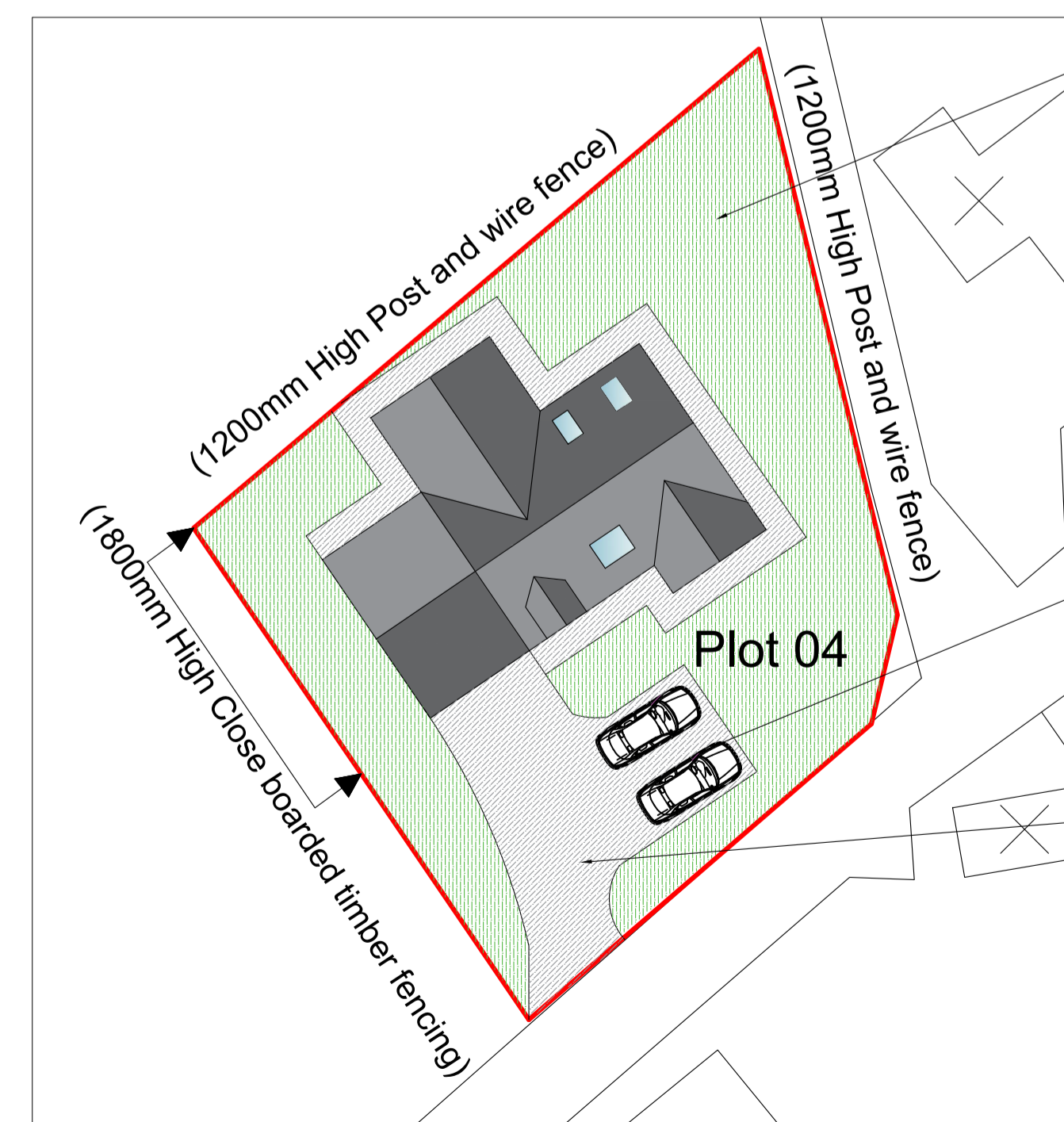
Proposed Block Plan Scale 1/250