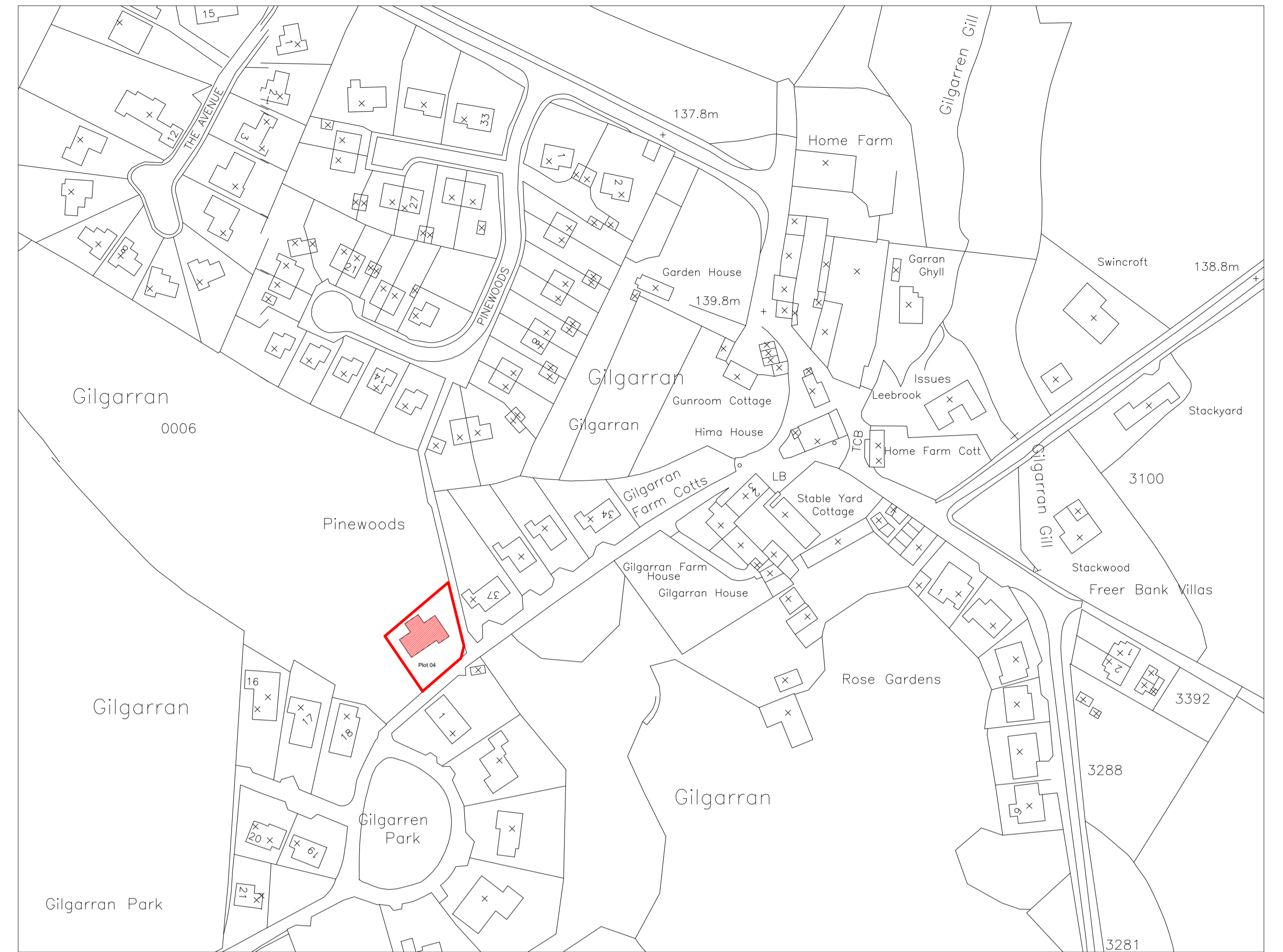
Proposed Location Scale 1/1250