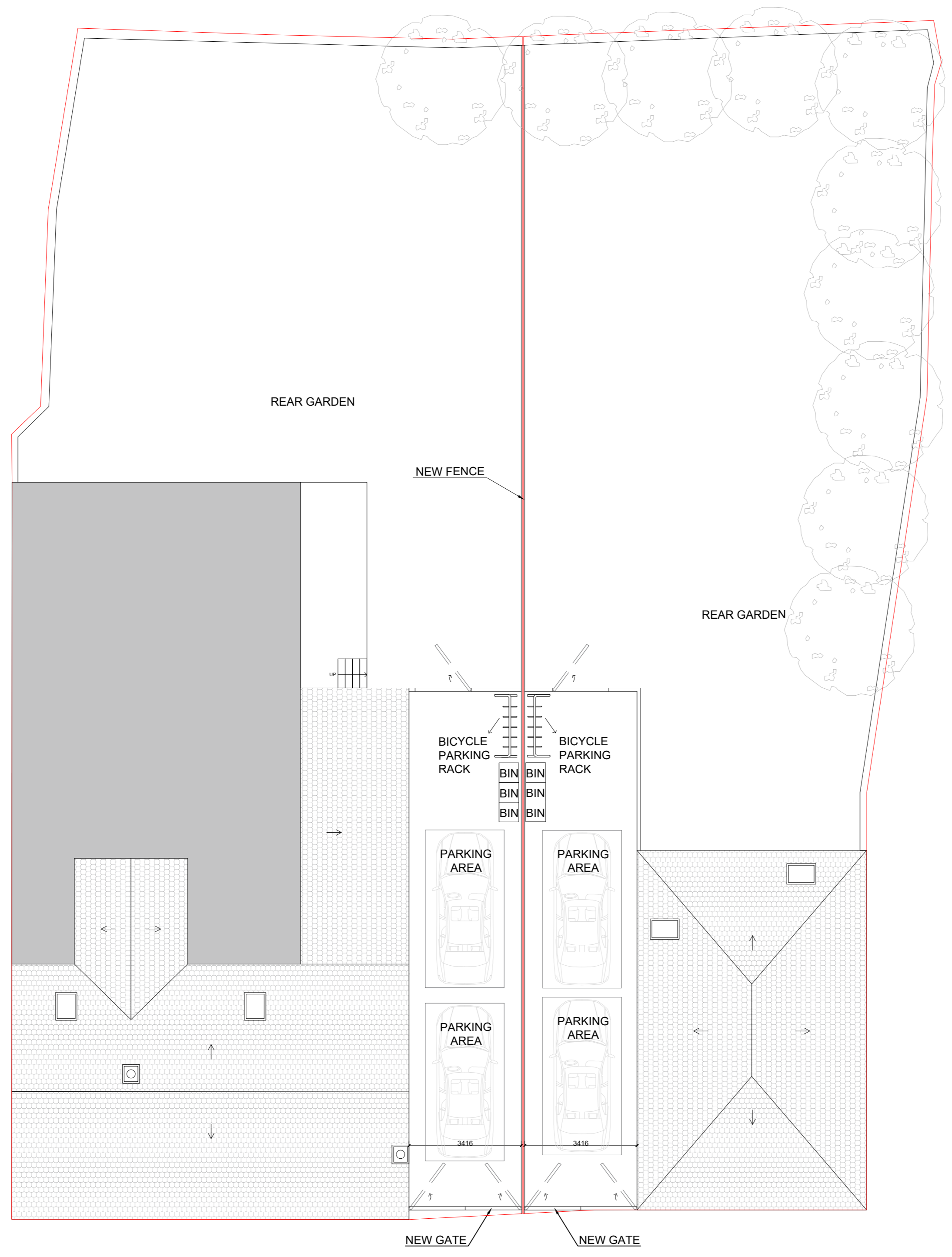
Proposed Roof Plan