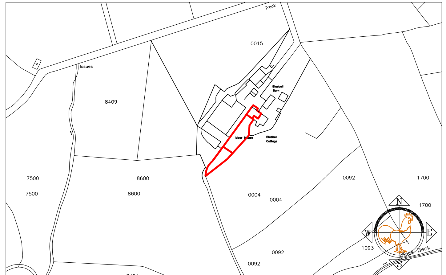
Existing Location Plan Scale 1/2500