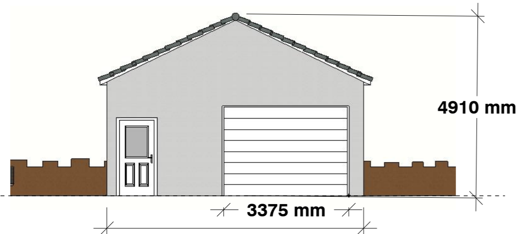
Proposed garage Front Elevation