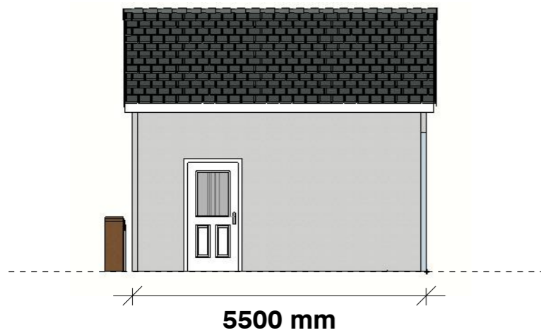
Proposed garage (East) Side Elevation