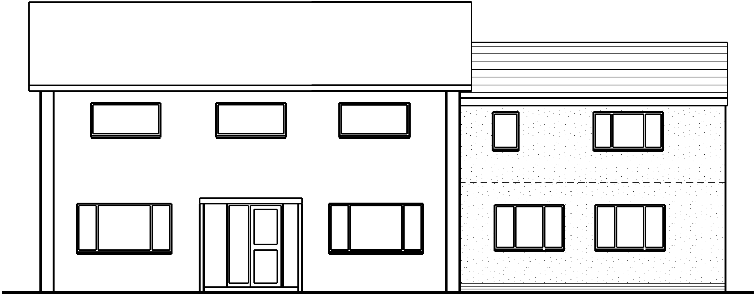
proposed front elevation