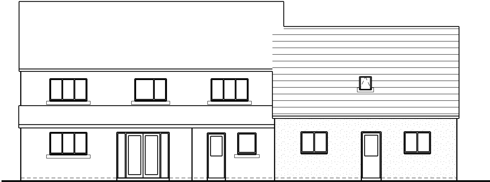
proposed rear elevation