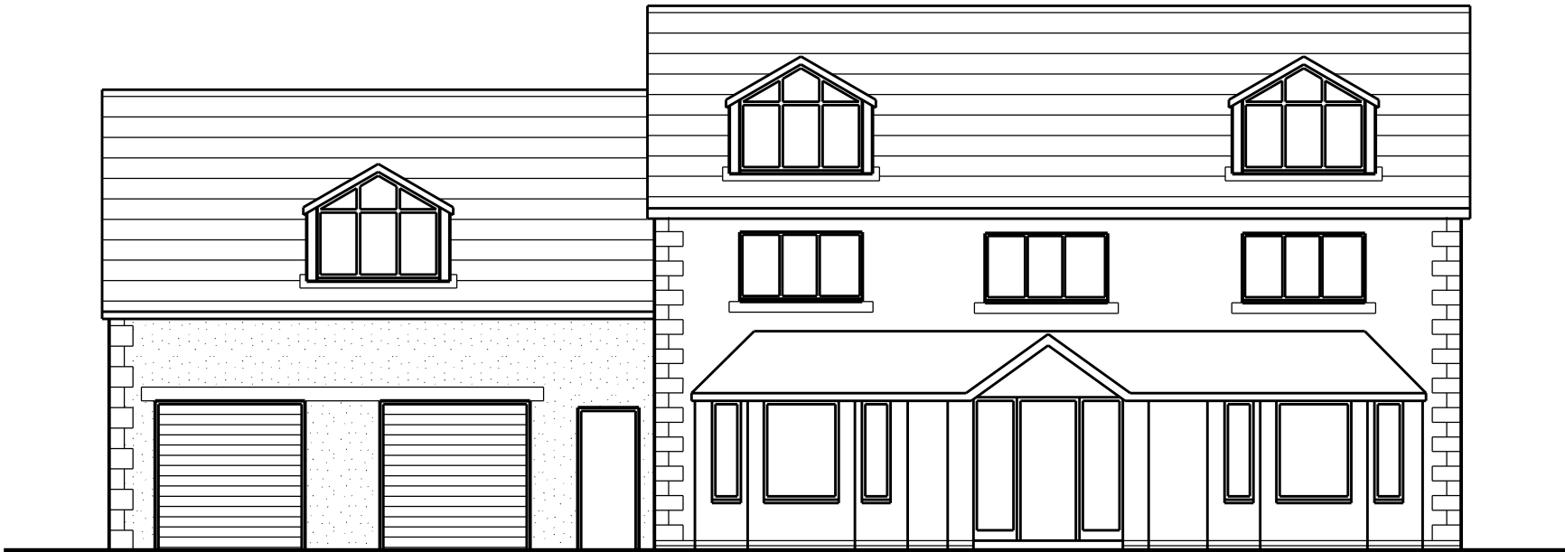
proposed front elevation