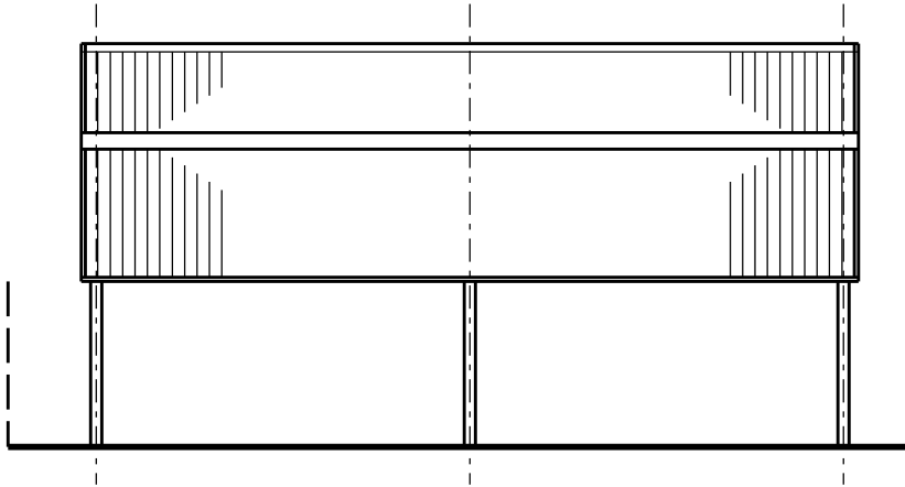
proposed side elevation (west)