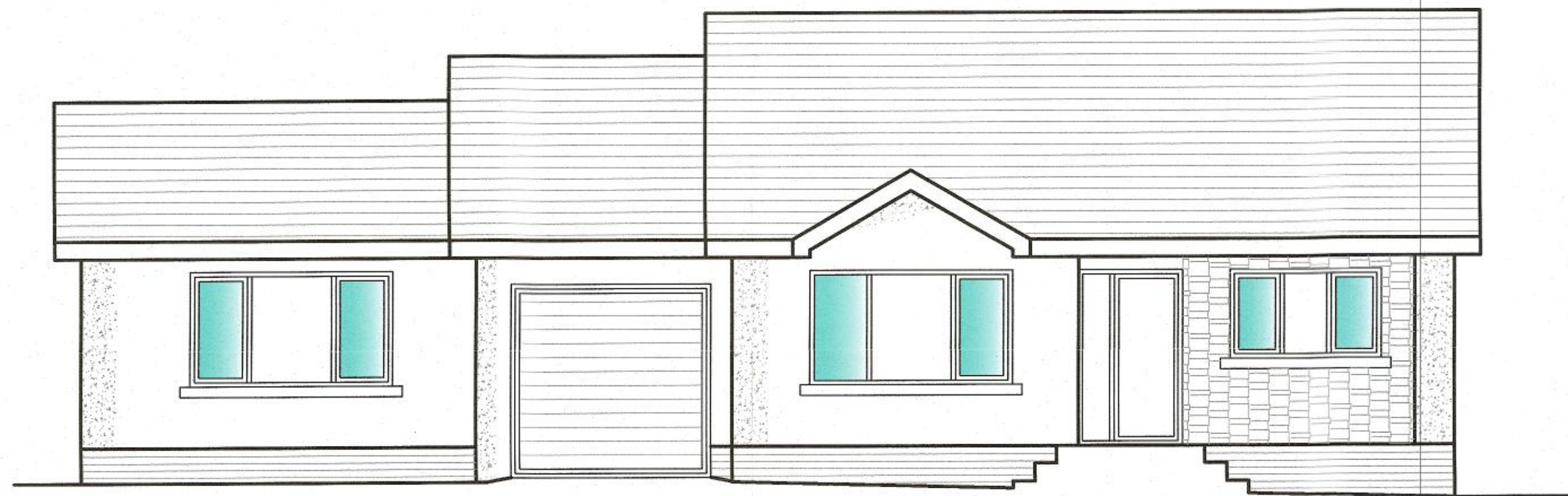
FRONT ELEVATION AS PROPOSED Scale 1:50