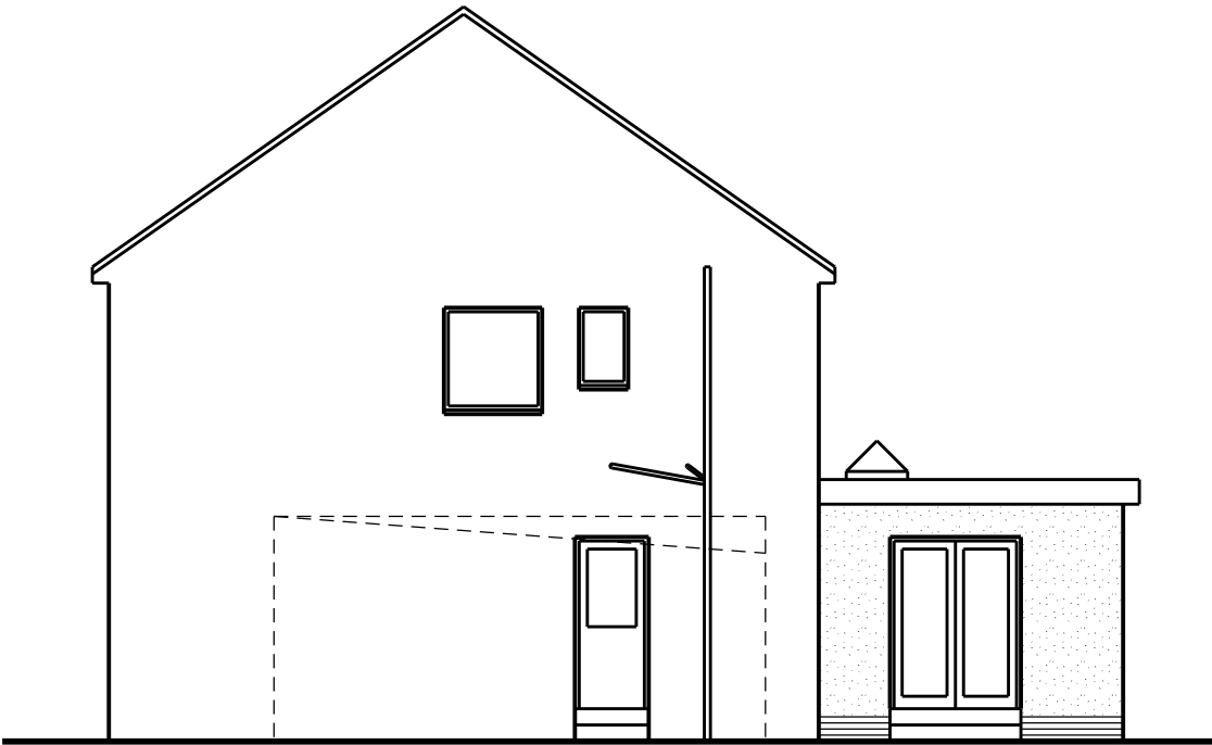
proposed end elevation (north)