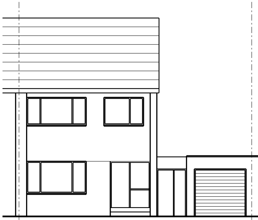
proposed front elevation (east)