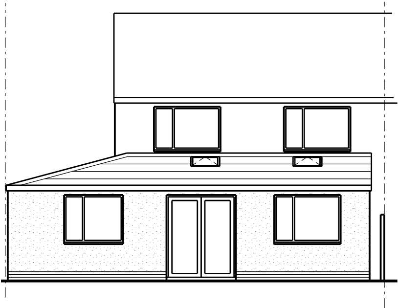
proposed rear elevation