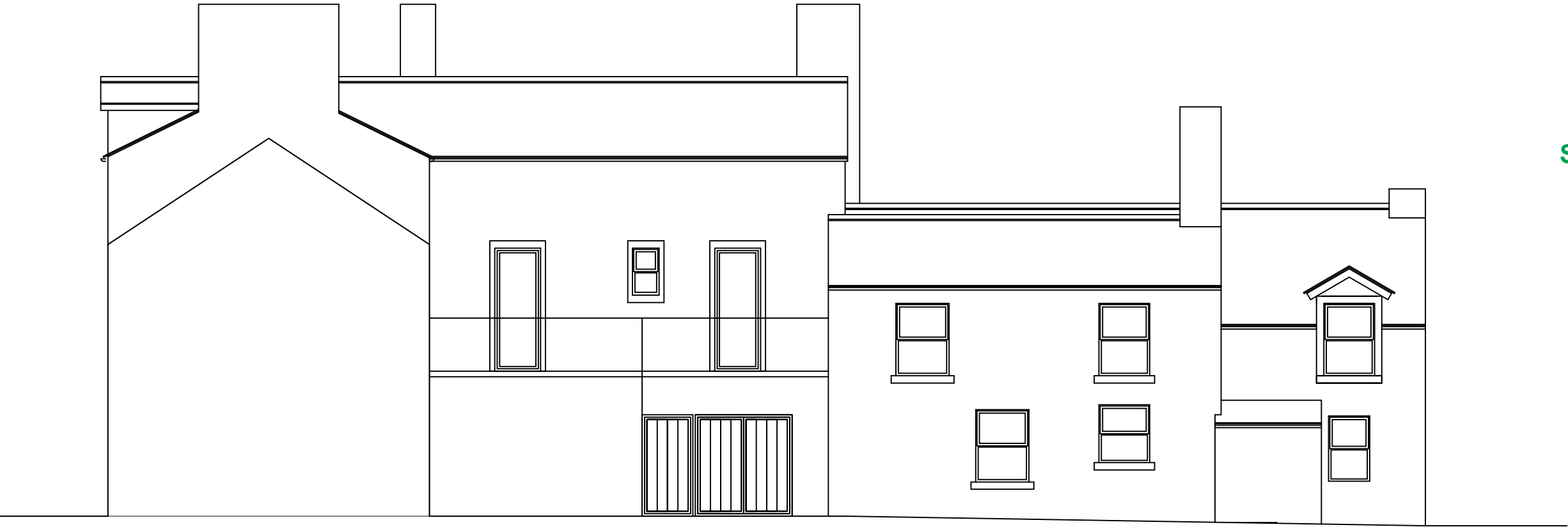
East Facing Elevation