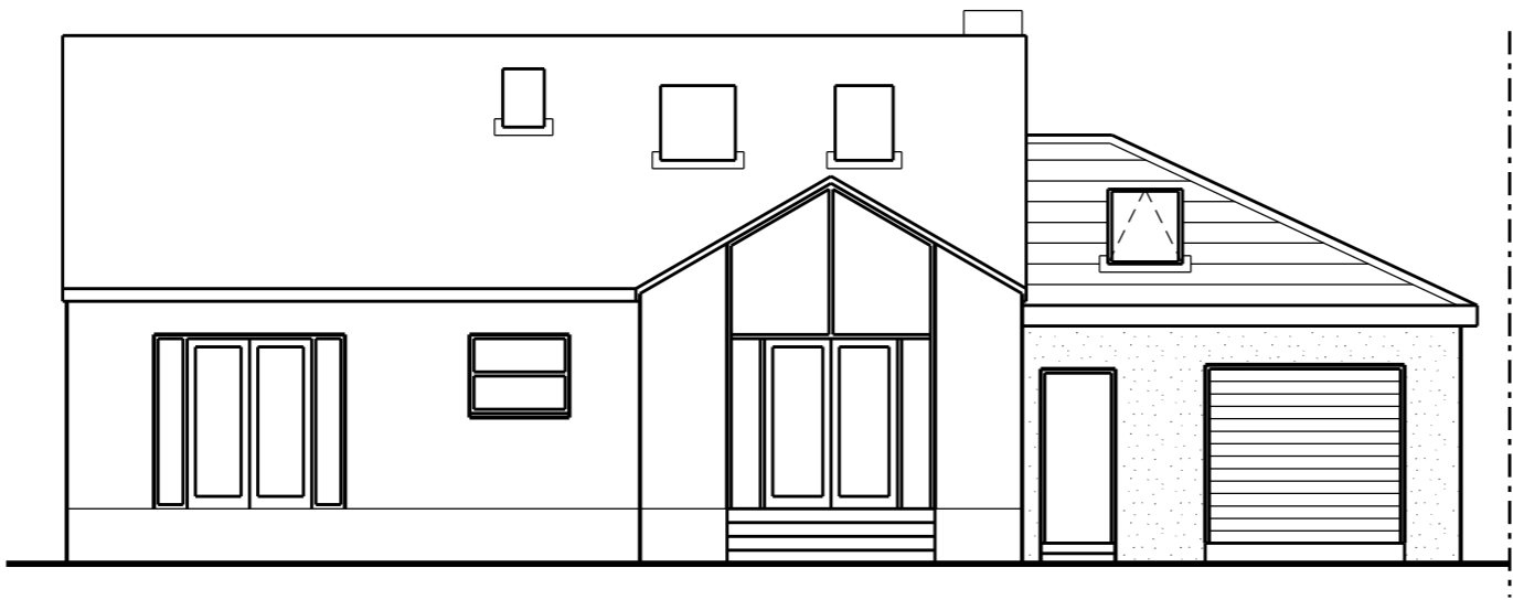
proposed rear elevation (east)