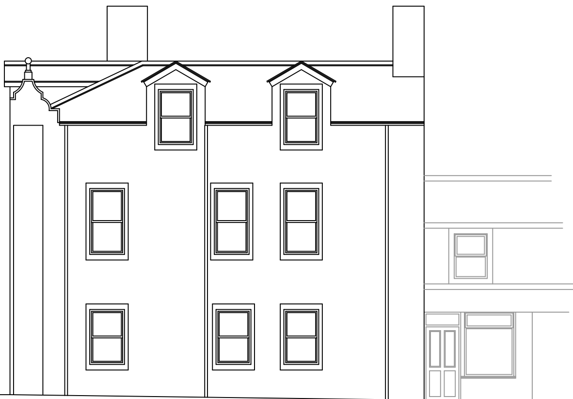
South Facing Elevation