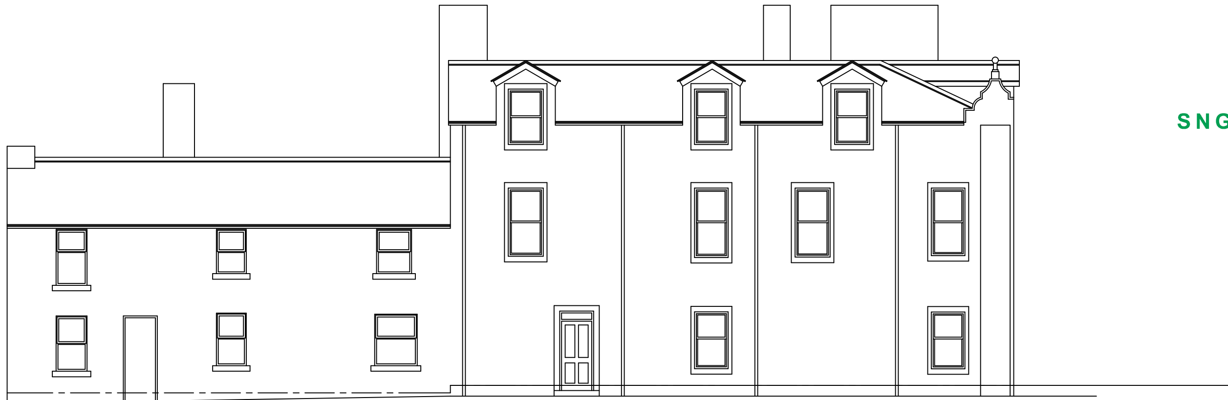
West Facing Elevation