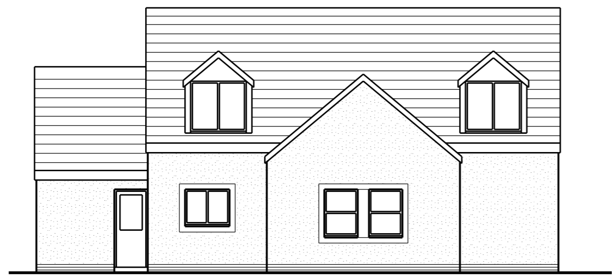
elevation C (west)