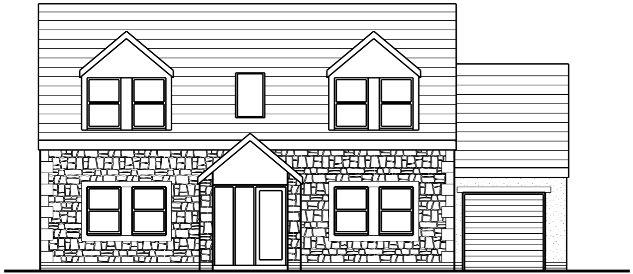
elevation A (east)