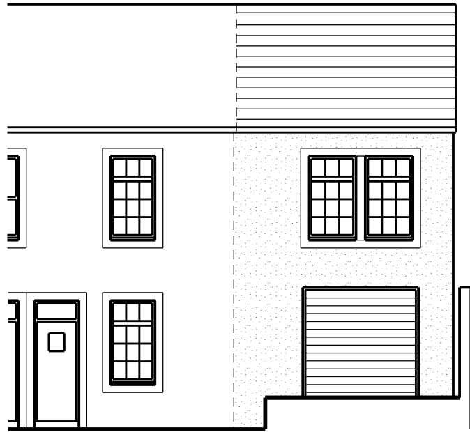
proposed front elevation