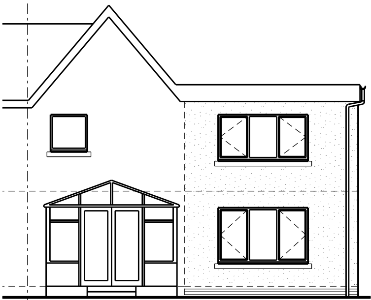
proposed rear elevation