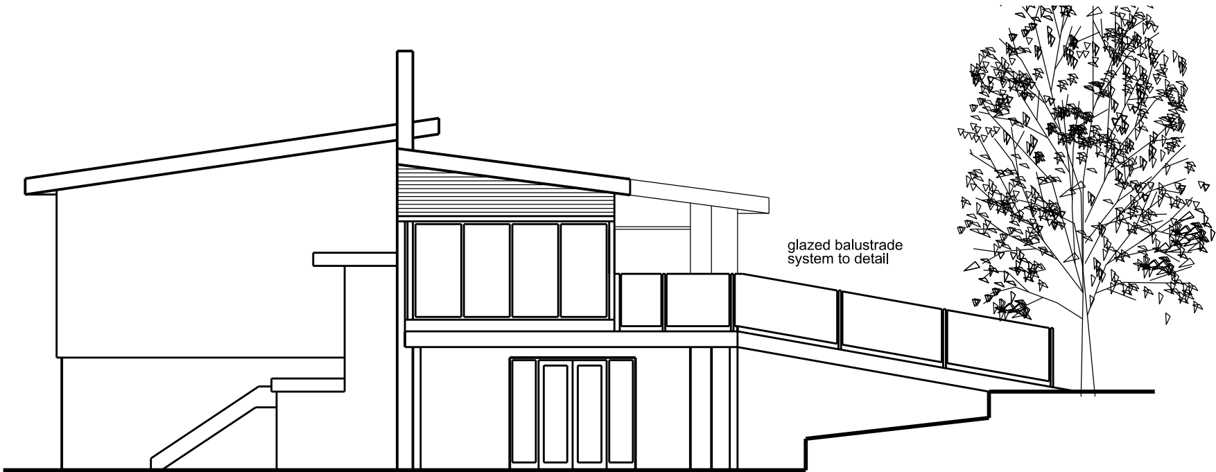
proposed south east elevation