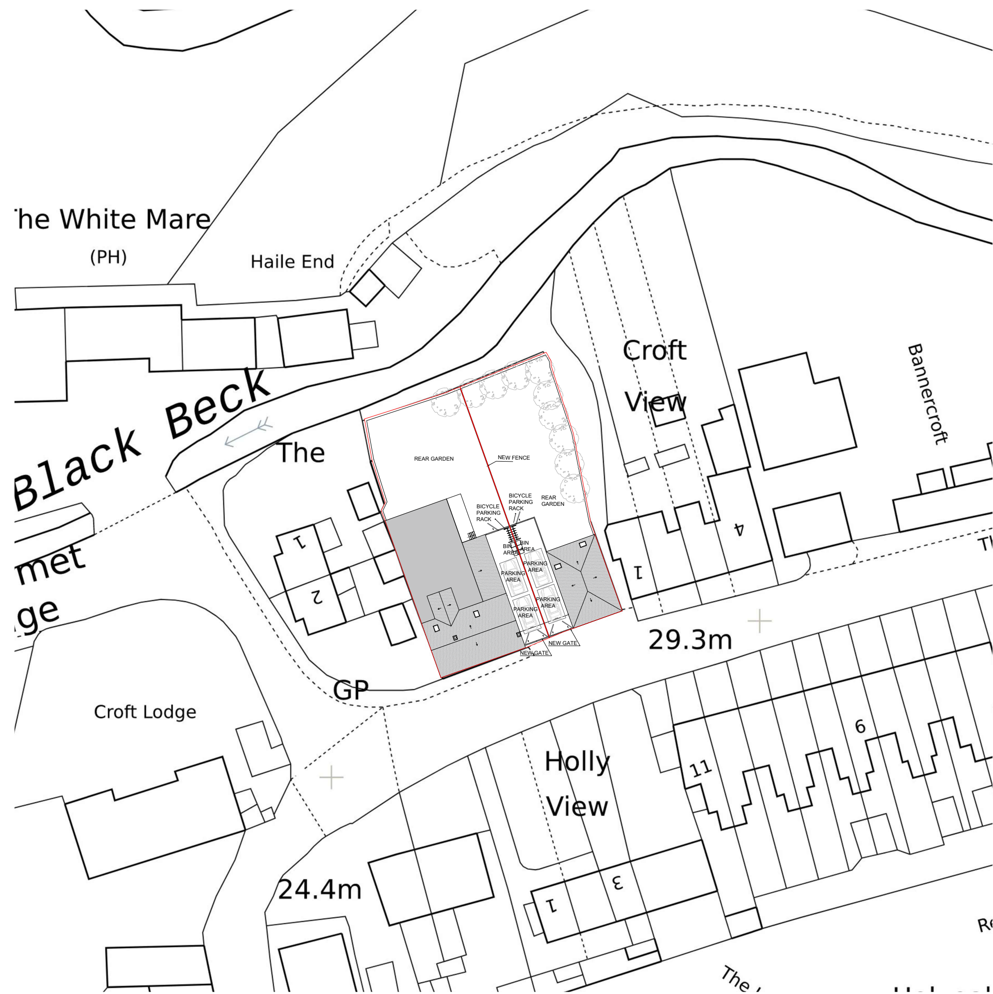
Proposed Block Plan

Block Plans are scaled from the Ordnance Survey Location Maps. Please see the licence number for the Os Maps in the Location Plans