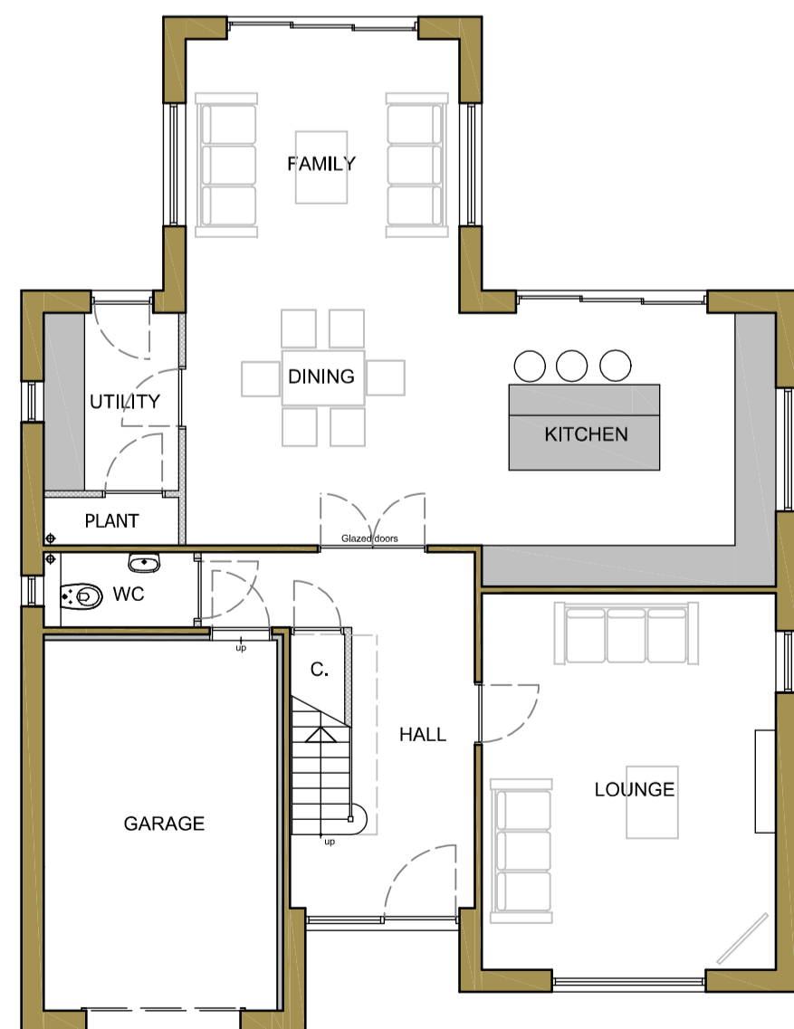
GF PLAN 98.20m 2 G.I.A.+ garage @ 19.25m 2 .

TOTAL G.I.A. - 216.41m 2 (2325 sq. ft.) plus garage.