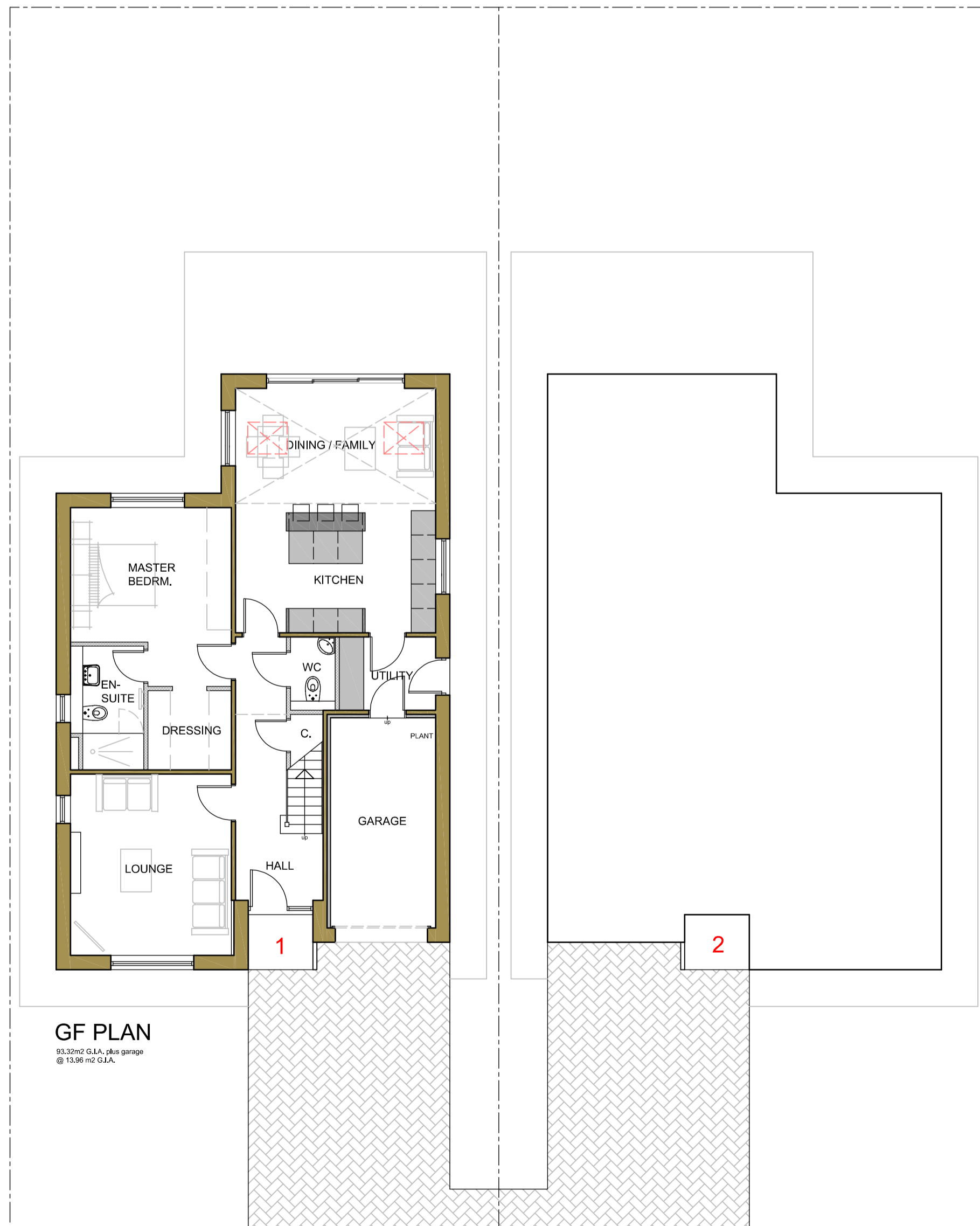
GF PLAN 13.29m 2 G.L.A. (13.29m 2 G.L.A.) © 13.96 m 2 G.L.A.

This drawing and design is copyright and must not be reproduced in part or in whole without prior written consent. Contractors must verify all dimensions on site before commencing work or preparing shop drawings.