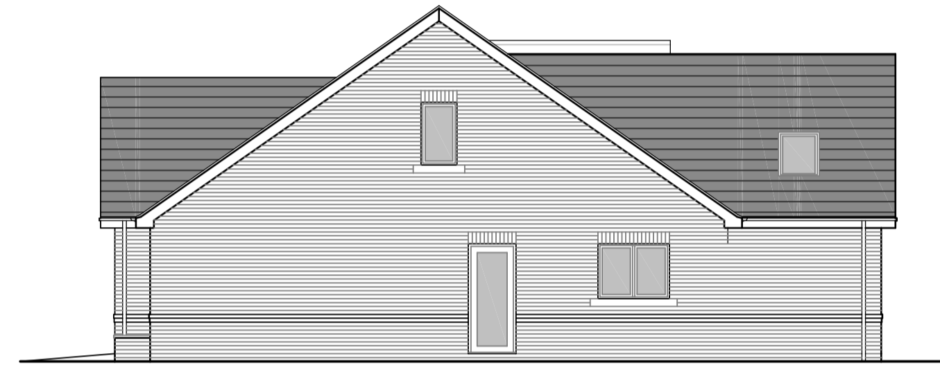
NW ELEVATION (PLOT 1) SE ELEVATION (PLOT 2)