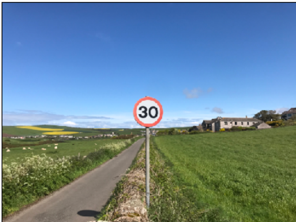
Figure 4: Showing the western boundary of the site and Nethertown Road, looking north.