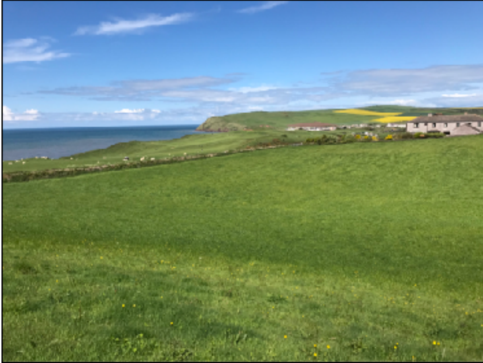
Figure 3: Showing the site looking north west towards St. Bees Head from beyond the southern boundary.