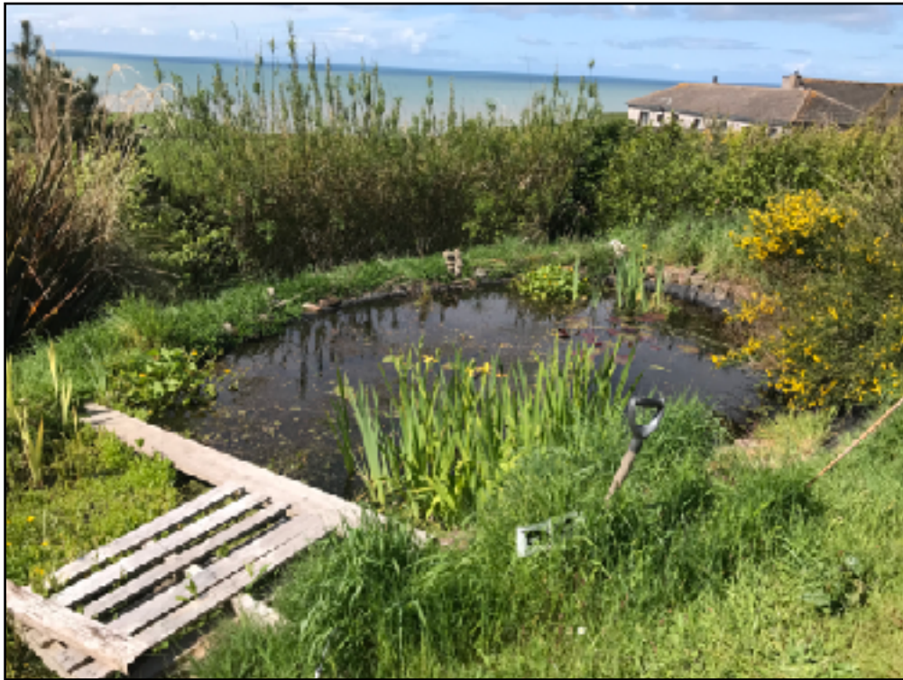
Figure 5: Showing the pond which exists in an adjacent garden - which returned a 'negative' great crested newt eDNA sample result.