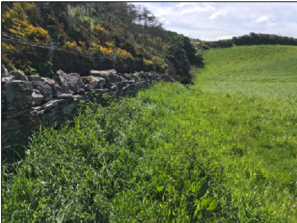
Figure 2: Showing the eastern boundary of the site looking south.