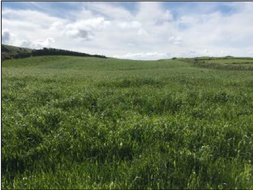
Figure 1: Showing the site looking south from the northern boundary.