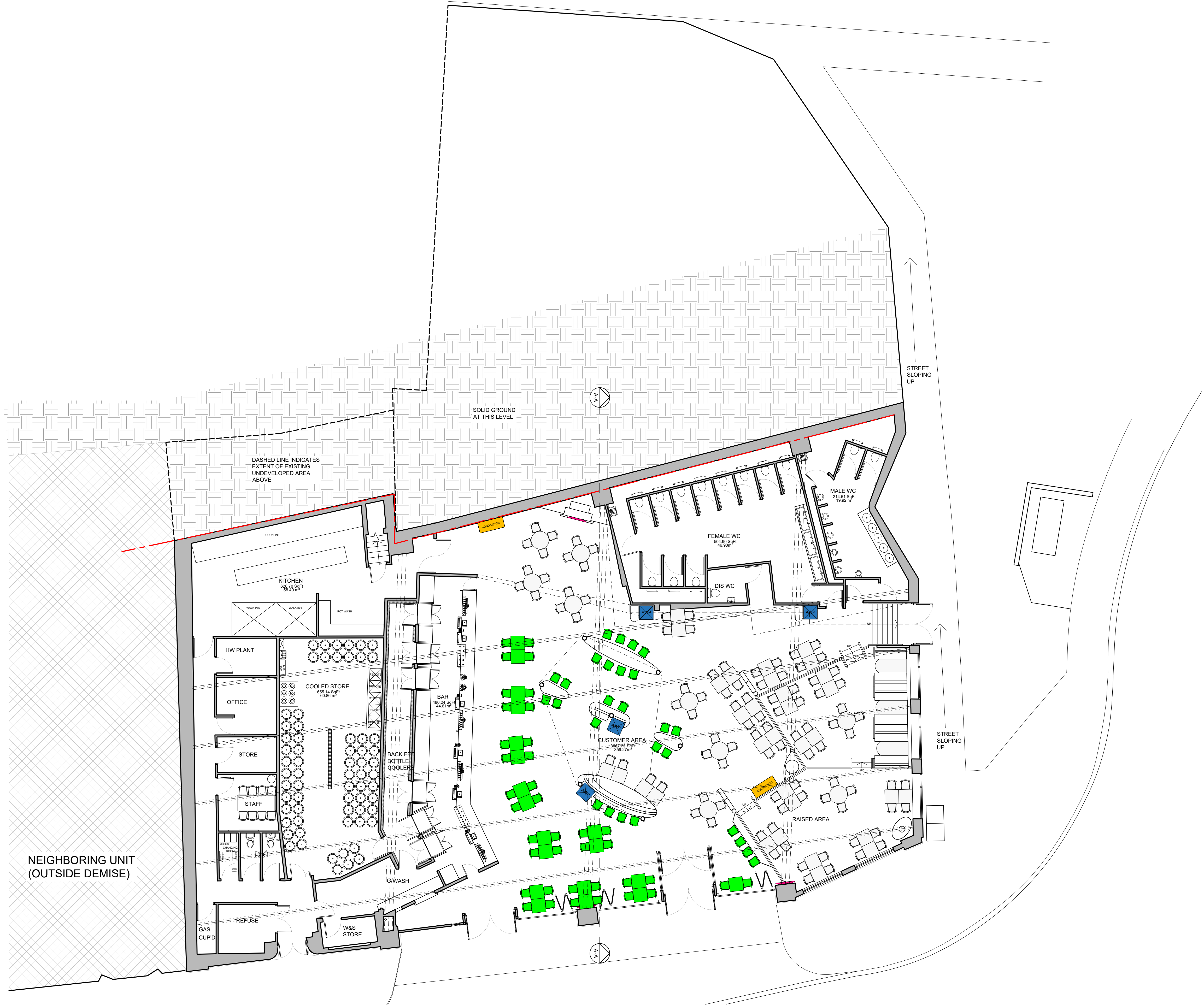
EXISTING GROUND FLOOR PLAN Scale 1:100