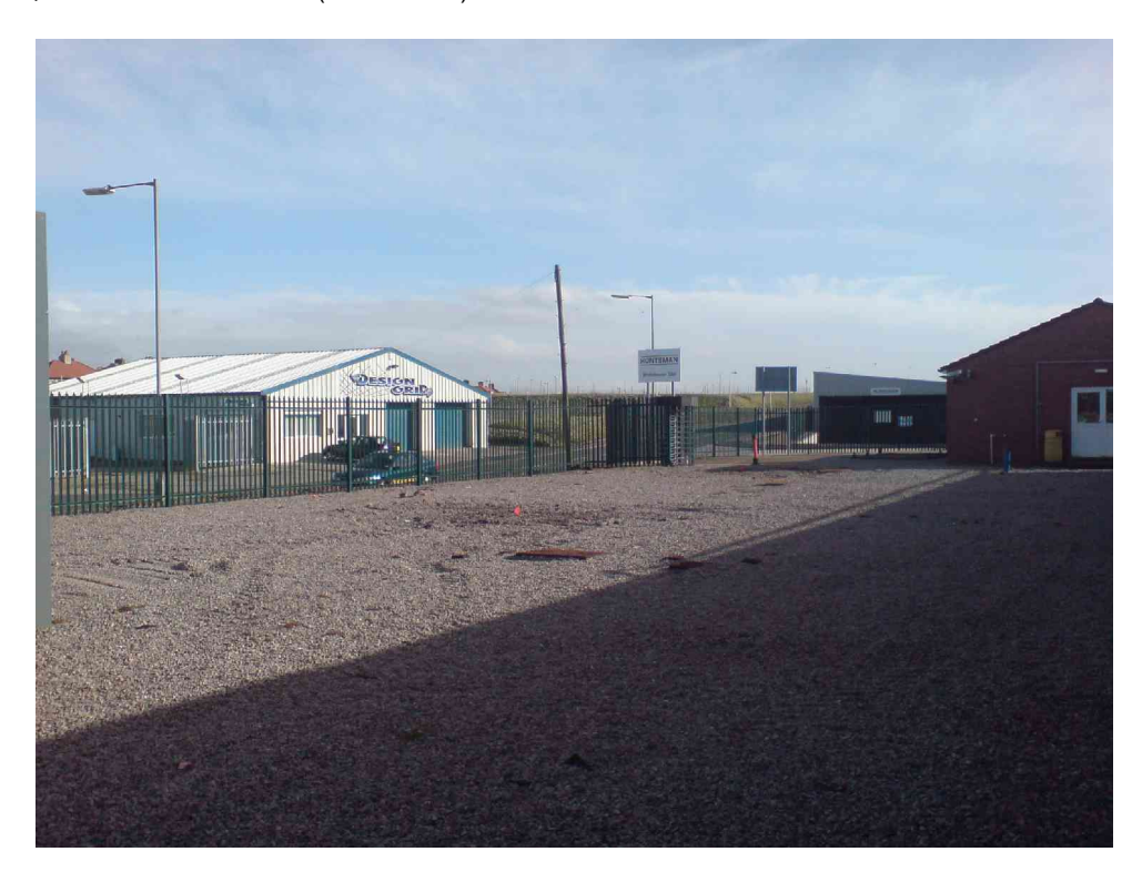
Plate 4 – View from ERM1 towards ERM2. Current Huntsman Office Building and groundwater well ERM2 are on the right side (view south).