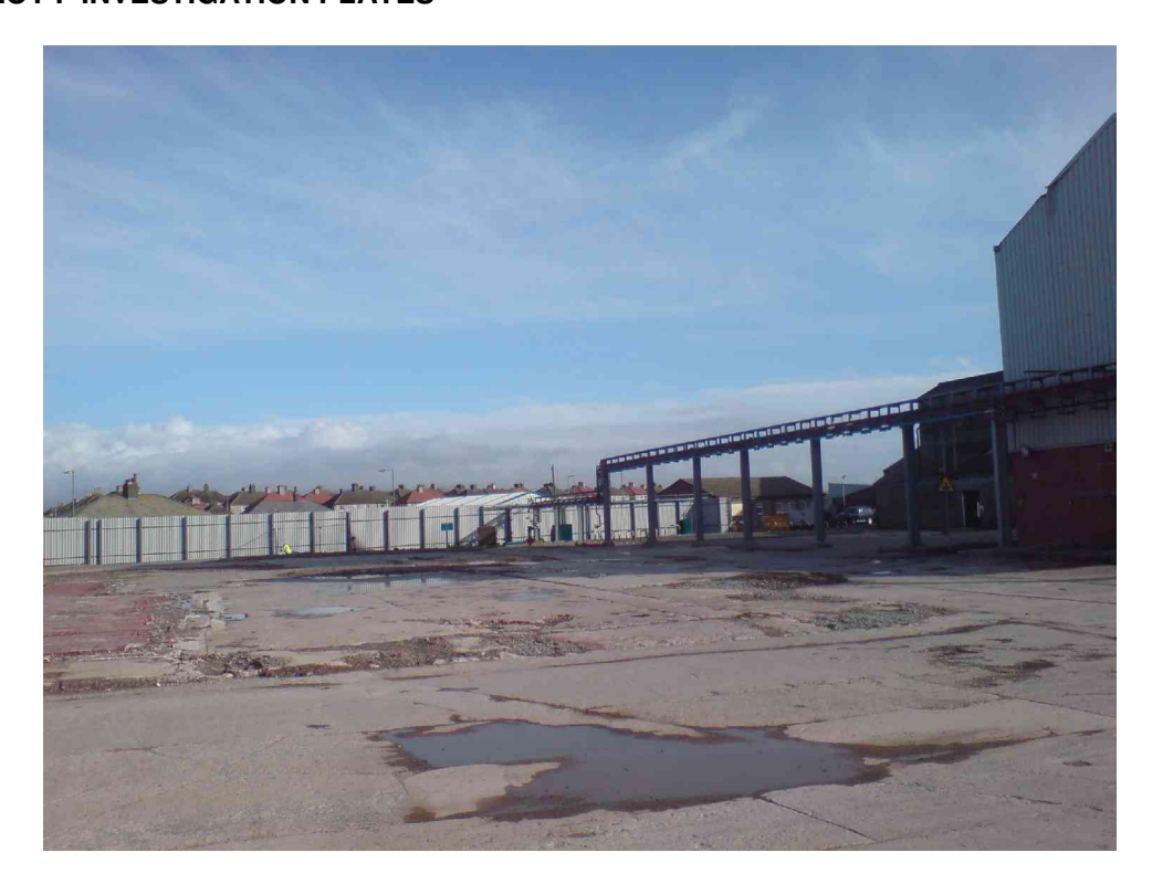
Plate 1 – View towards east of Plot F with the current Huntsman Office Building, and former dye shed next to S4 Building on the right and sheeted fence in centre of this picture.