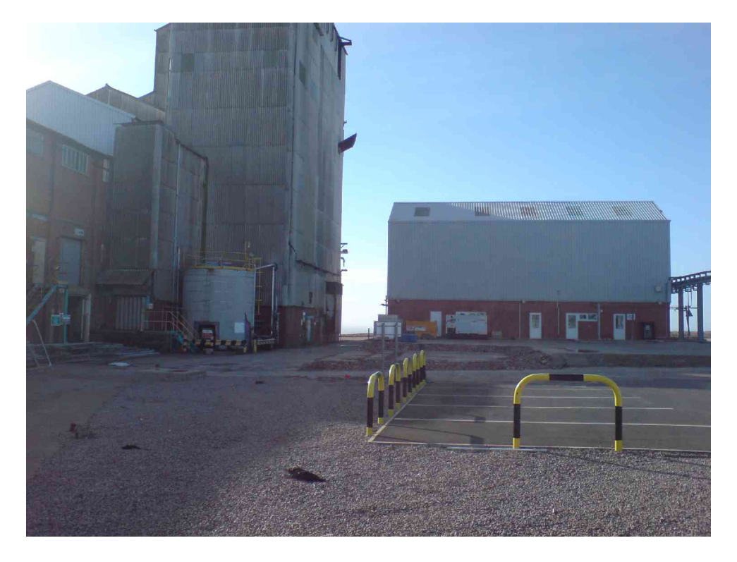
Plate 2 – View from TP752F towards former parking space on the right and S4 Building on the left side (view west).