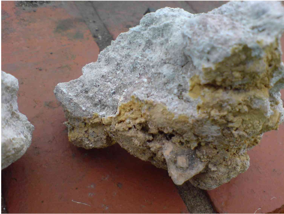
Plate 7 – located in several locations of Plot A and D. Blue-white cement clinker.