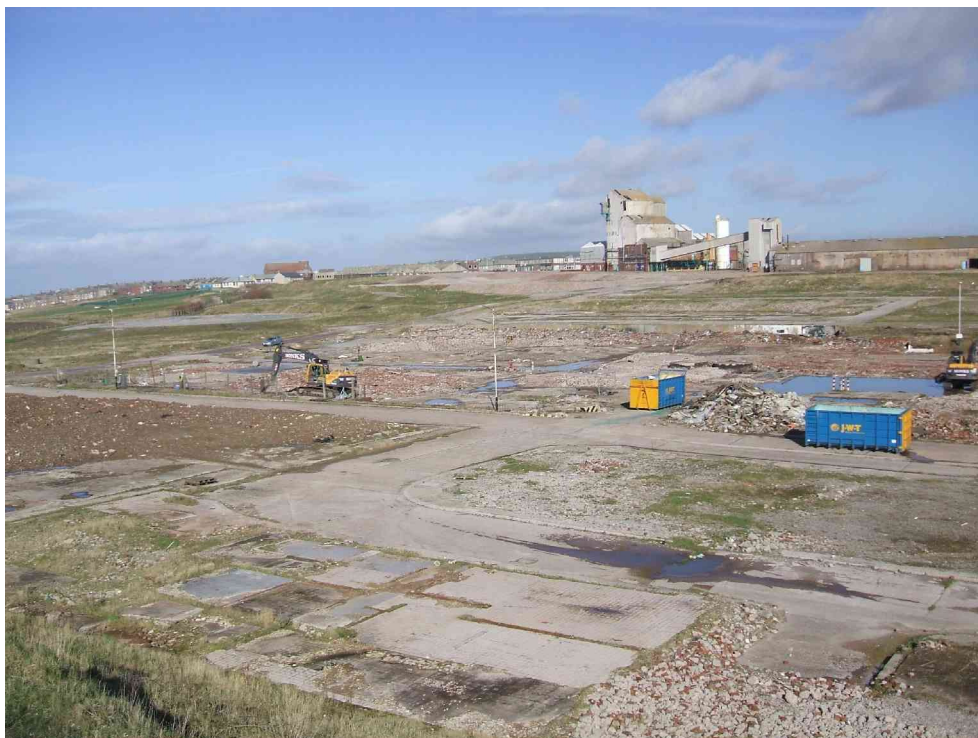
Plate 4 – View northeast over Plot D with former MNO, MOS, MO and UFEX Plants in the foreground and over former Alabaster Works Area to S4 Building in the background.