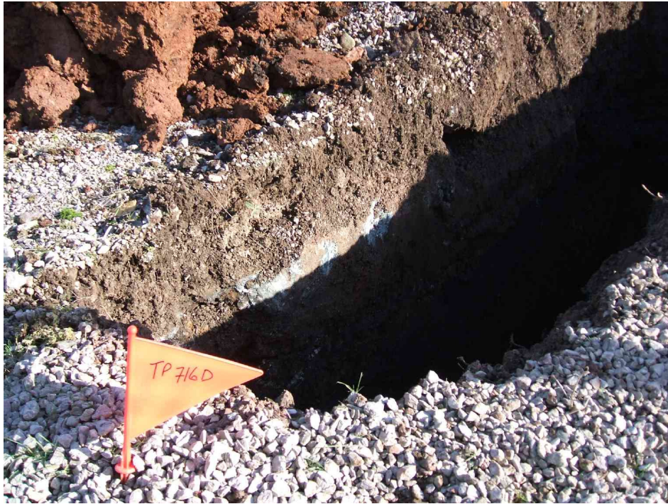
Plate 5 – TP716D – located in area of former storage tanks of MMO, MOS, MO and UFEX Plants, next to former Fatty Alcohol and Ethoxylation Plant. Top of trial pit is covered by hardcore gravel, followed by blue cement clinker overlaying gravely sand.