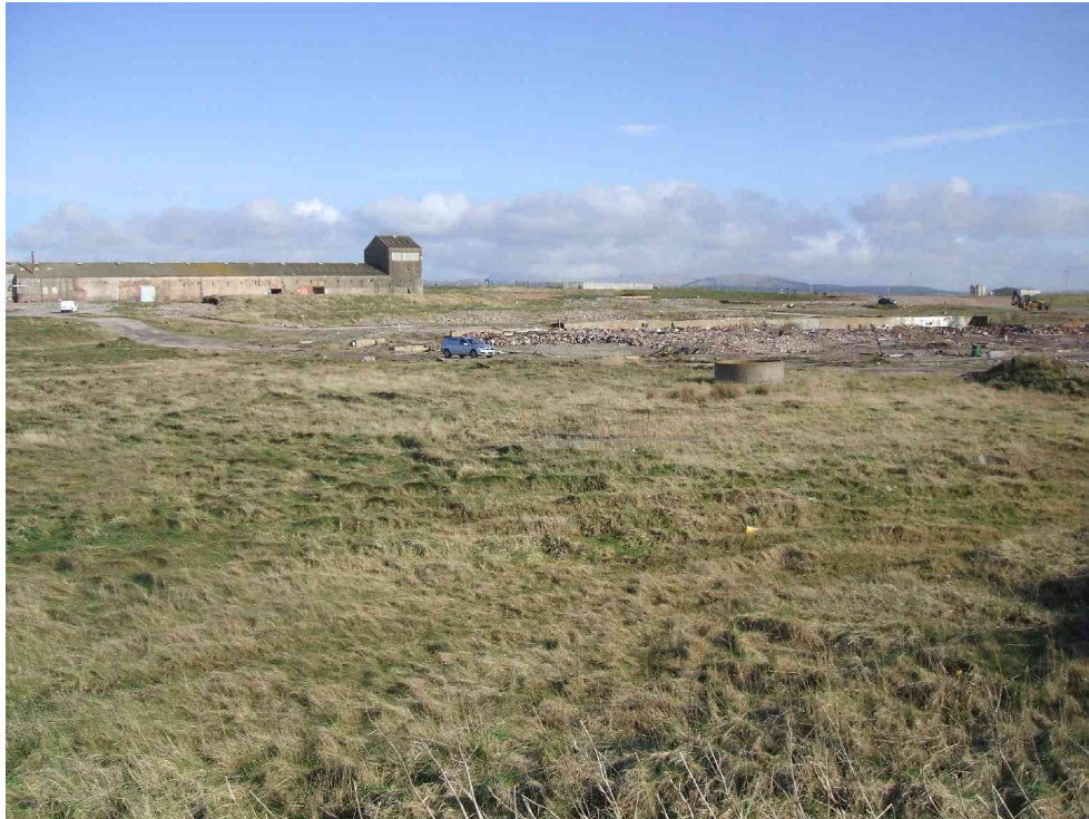
Plate 3 – View from TP702D over Plot D with area of former Croft Ladysmith Pit and Coke Works towards southeast with S4 Building in the background.