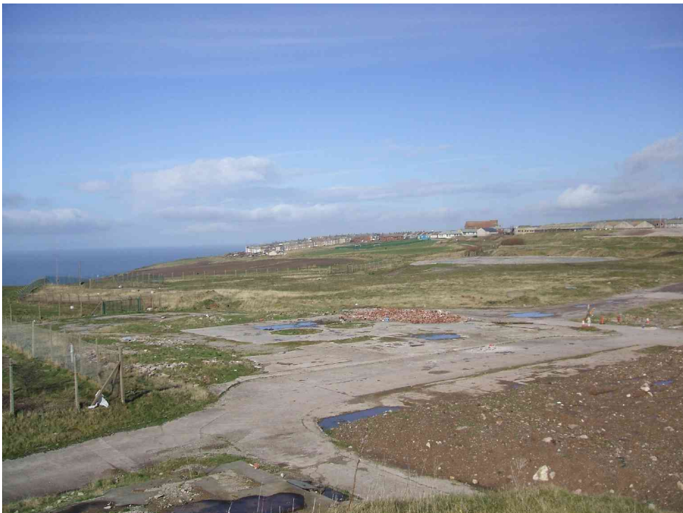
Plate 2 – View over Plot D towards the Irish Sea (view north – northeast).