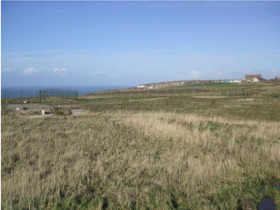
Plate 1 – View from WS712D towards the north