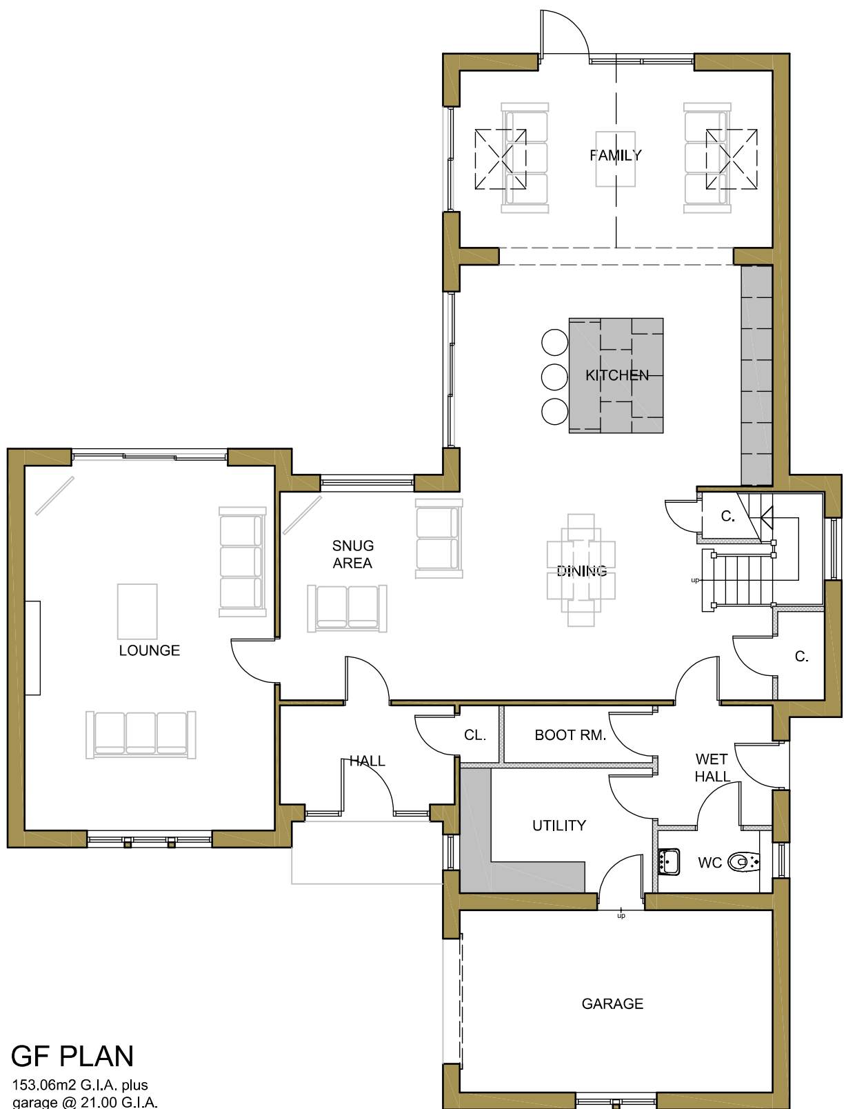
GF PLAN 153.06m2 G.I.A. plus garage @ 21.00 G.I.A.