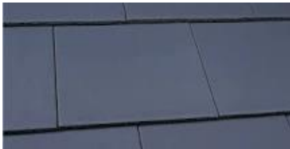
Marley Edgemere – Slimline concrete tiles