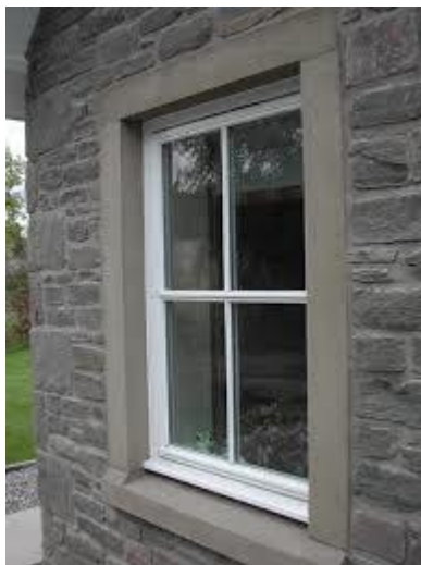
Cast stone Dark grey lintol and cill - example