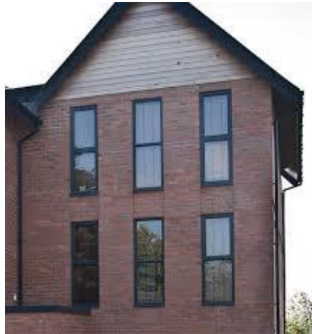
Example – factory painted aluminium windows with glazing bars