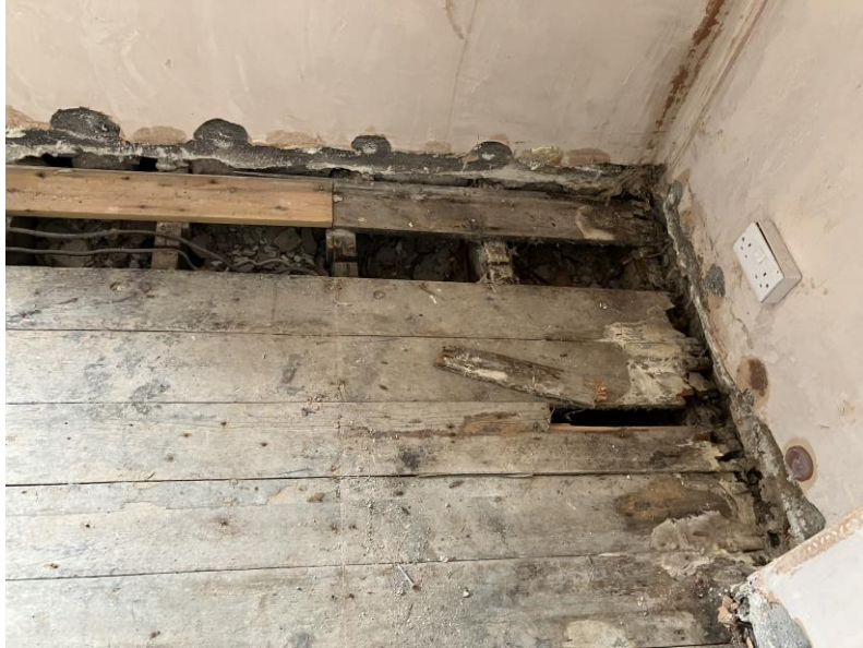
Above: dry rot in the corner of the second floor store