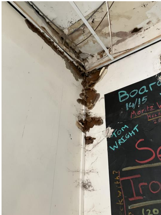
Above: dry rot in ceiling of ground floor Common room