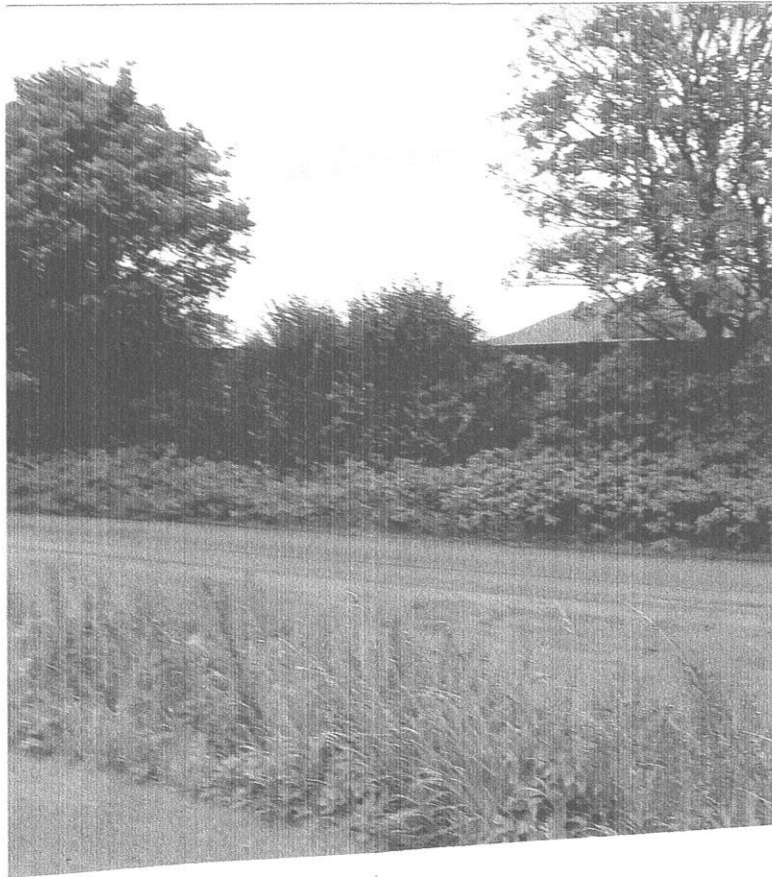
View of site from highway outside the site