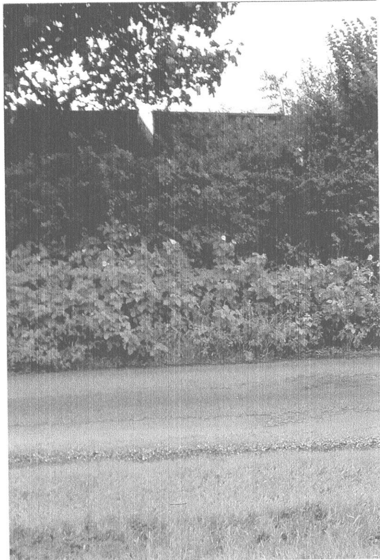
Closer views of containers from highway outside the site