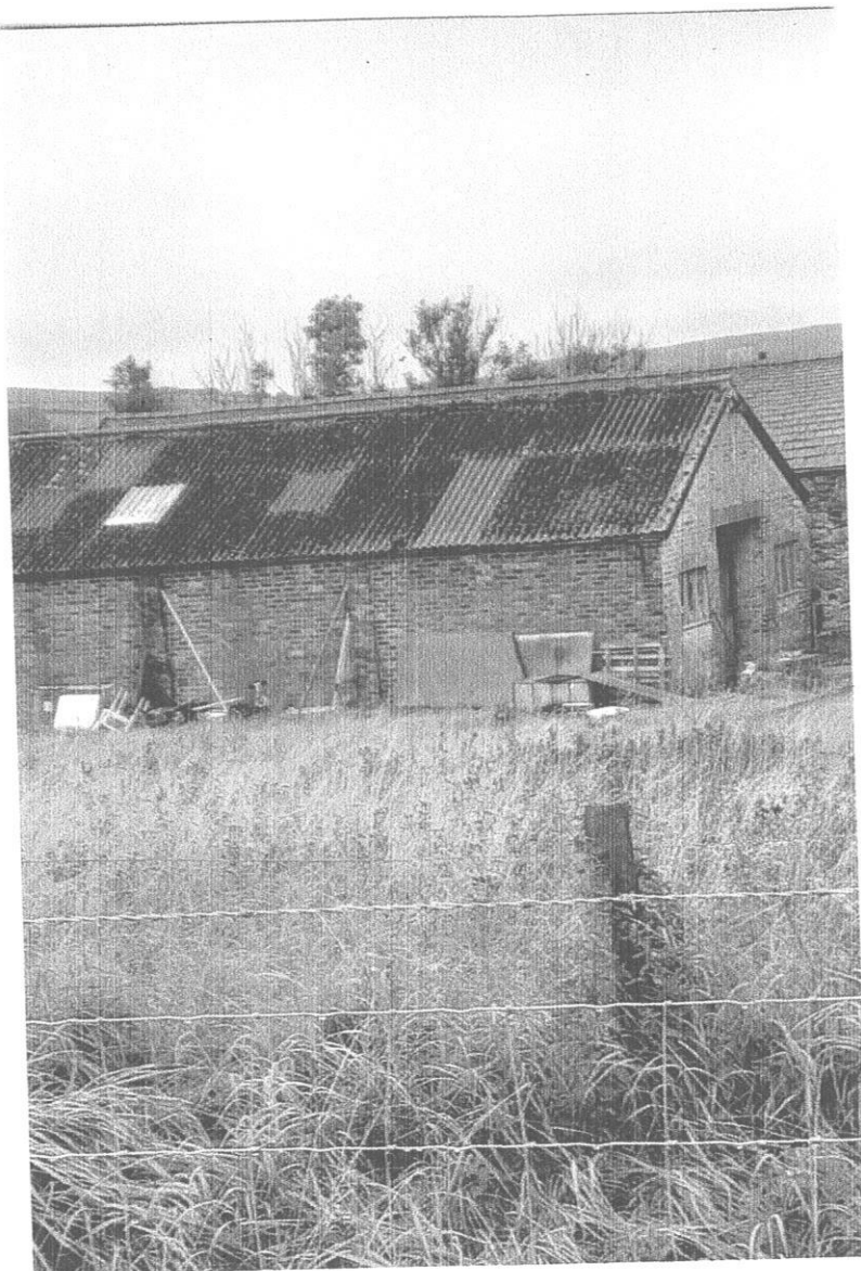
adjoining building in Whinich Farm (not in applicant's ownership)