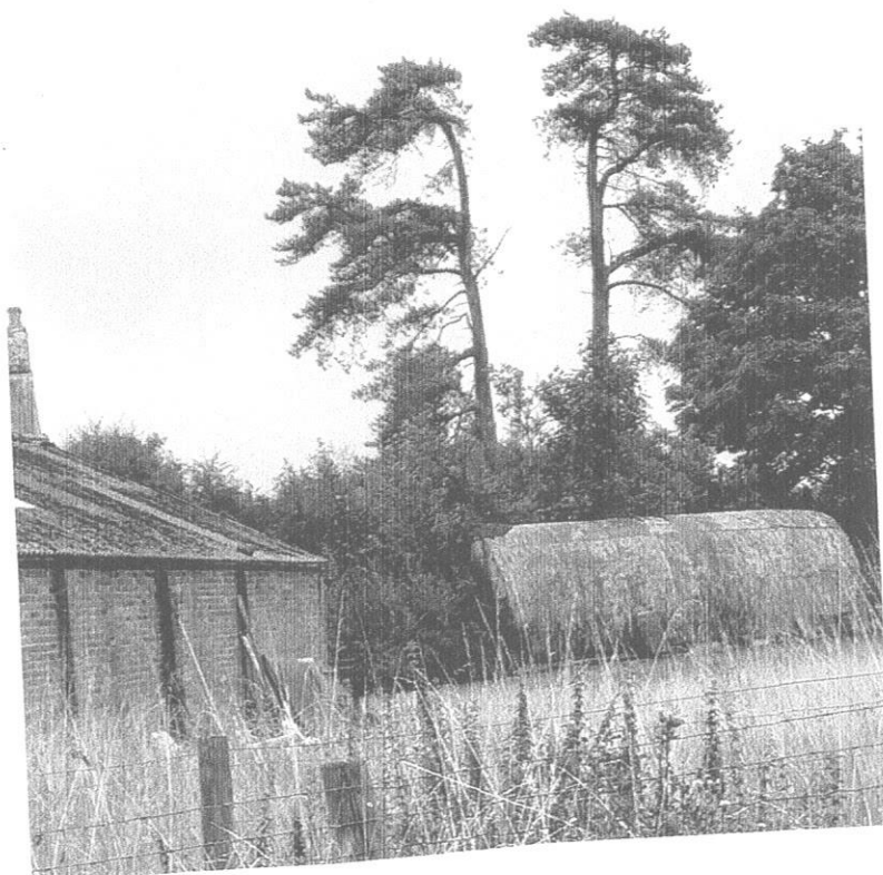
rural decal adjoining