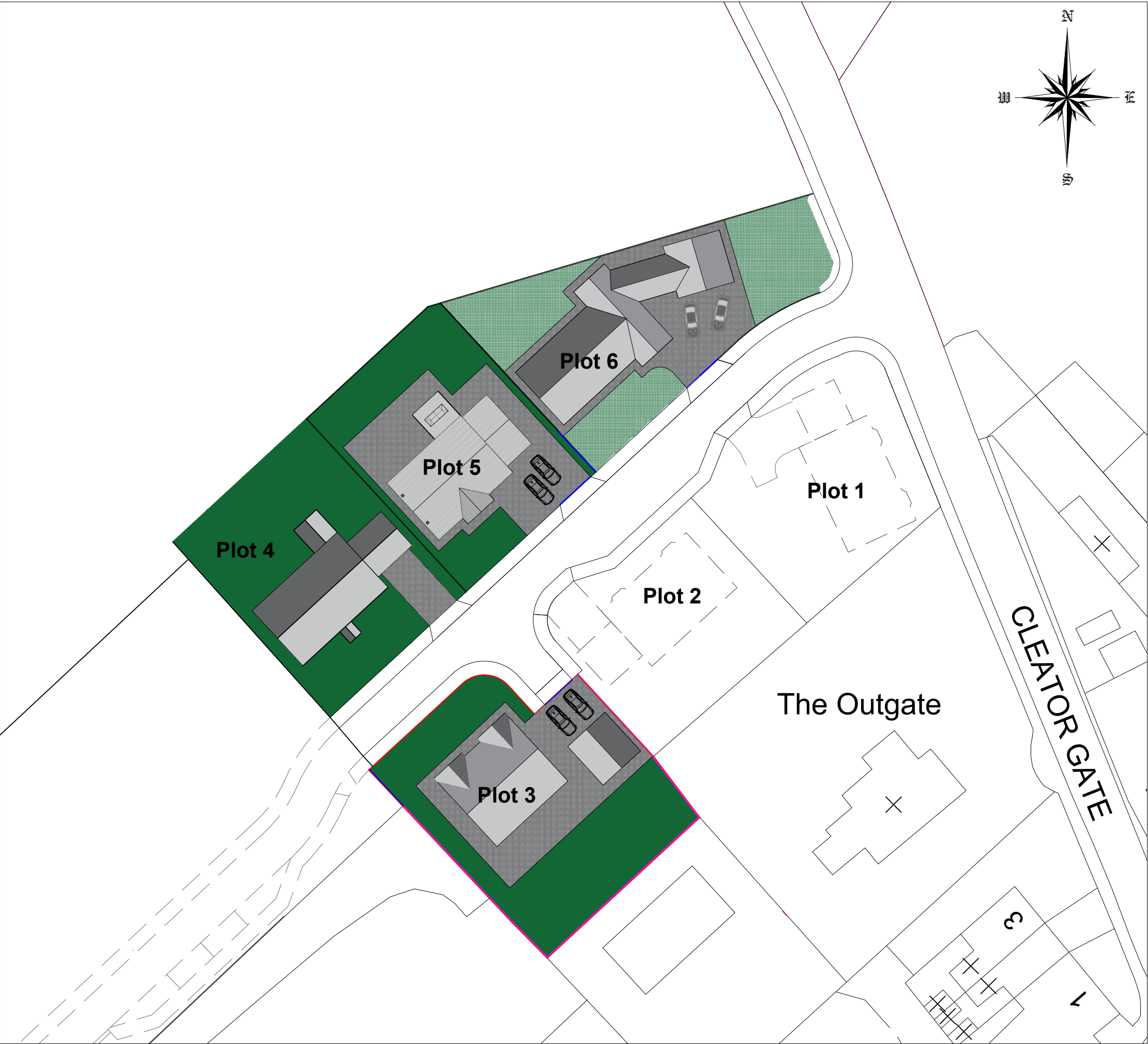
Proposed Block Plan 1/500