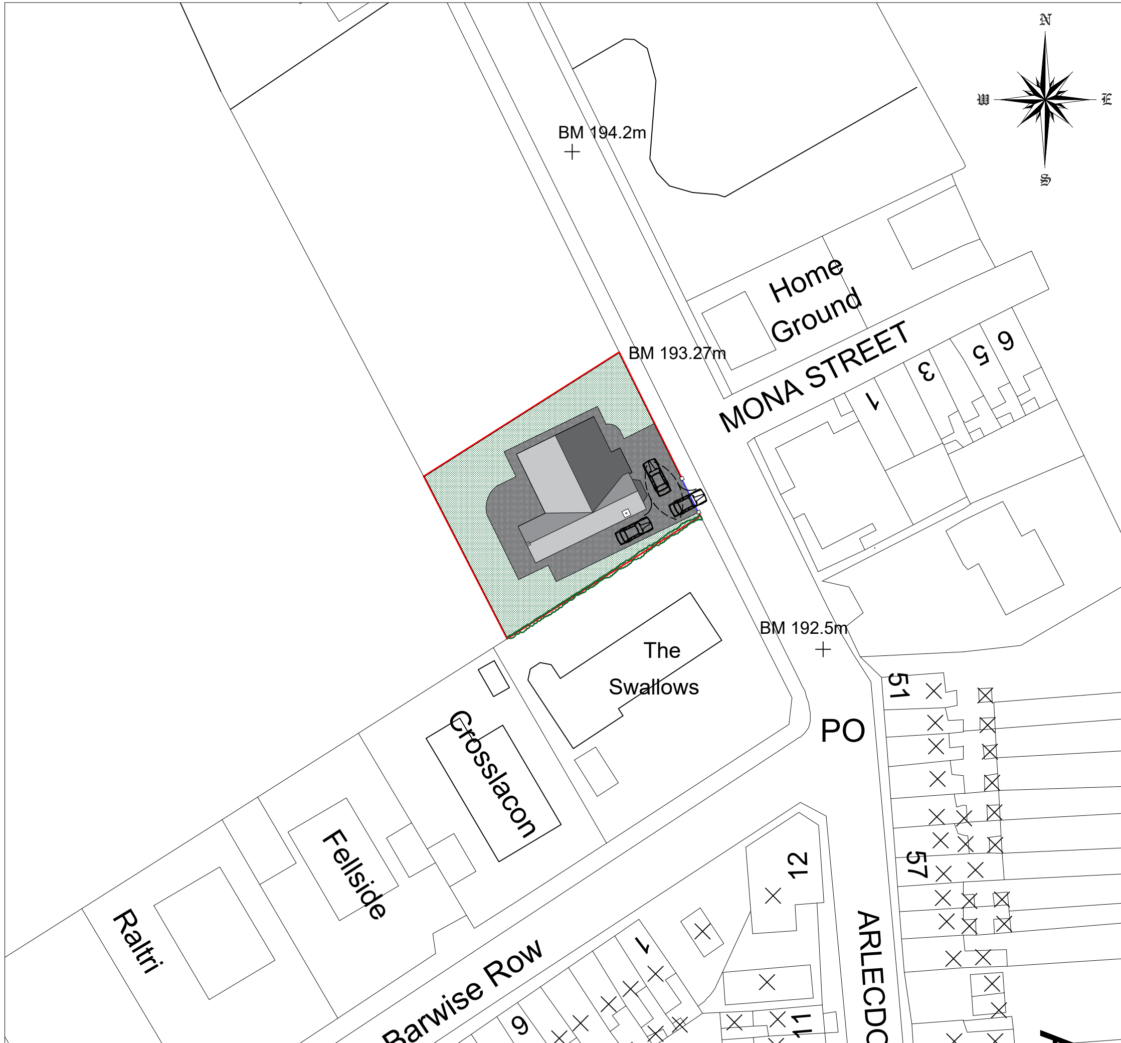
Block Plan 1/500