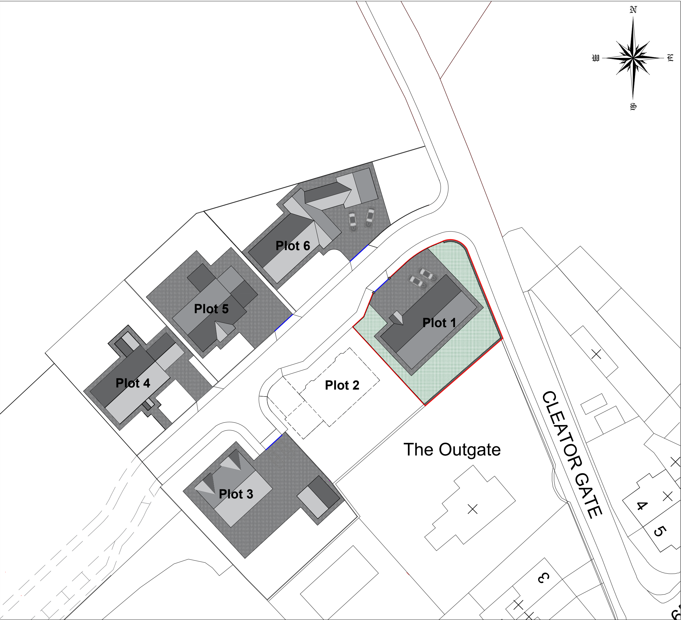
Proposed Site & Block Plan 1/500