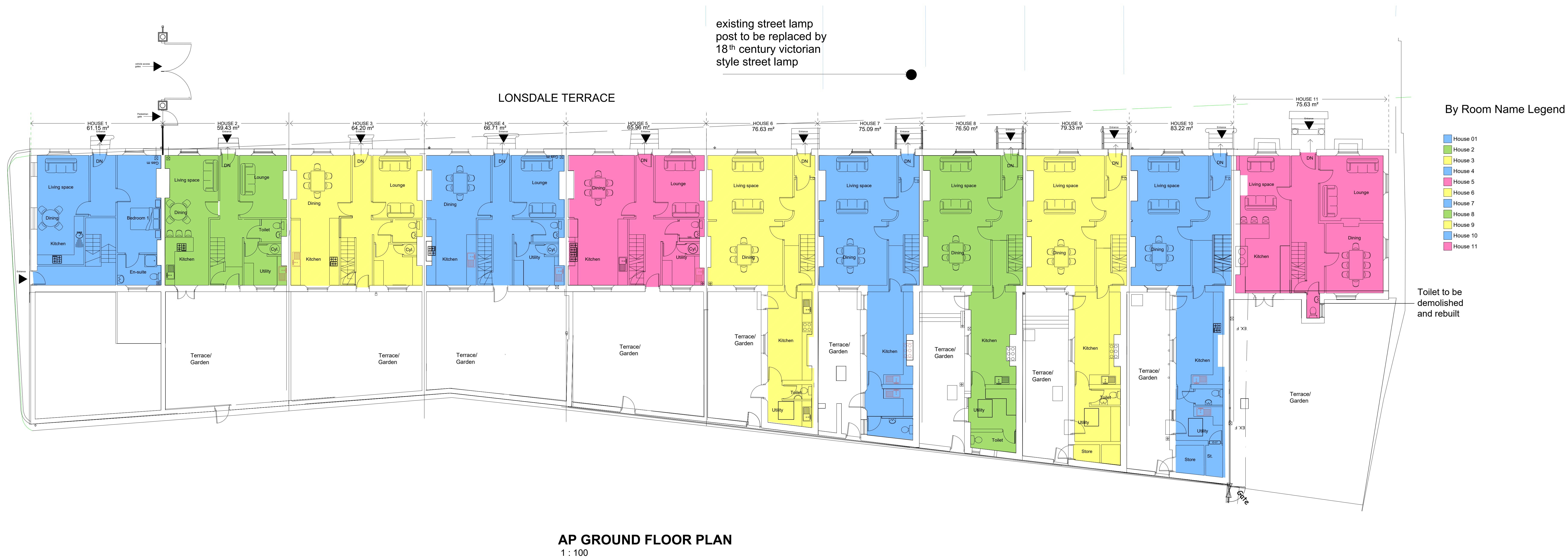
AP GROUND FLOOR PLAN 1 : 100