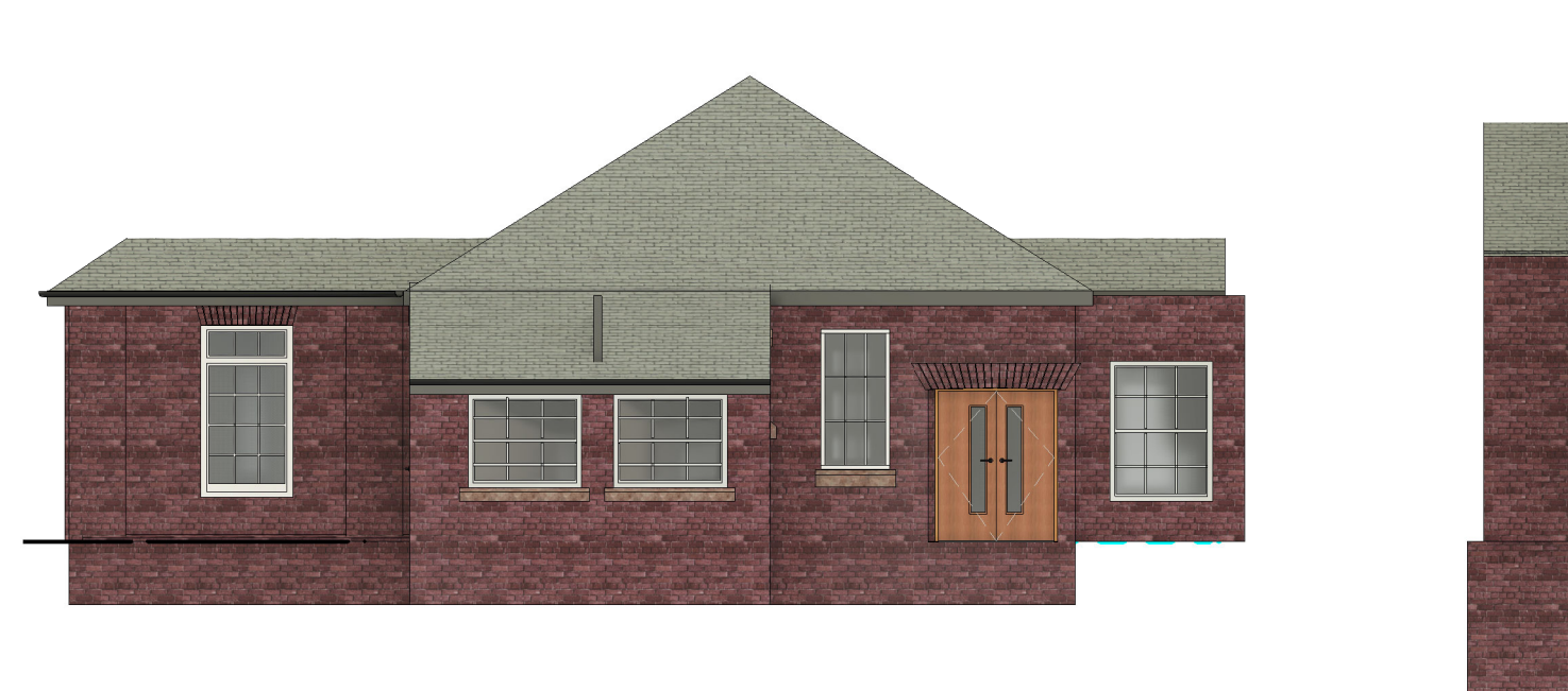
5 Proposed Elevation 5 1 : 100