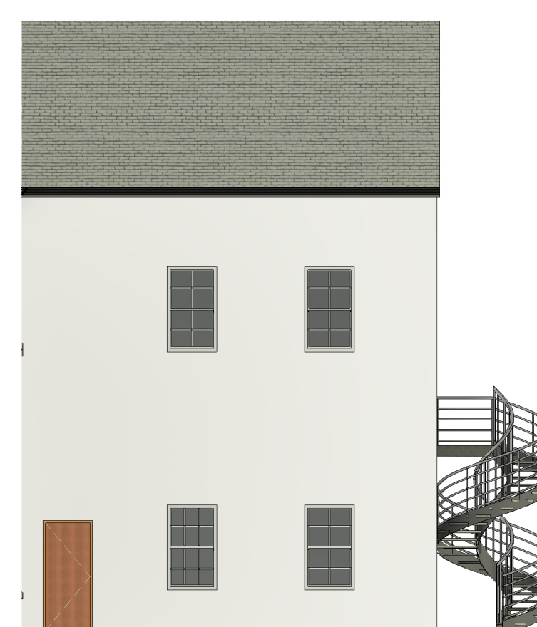
7 Proposed Elevation 7