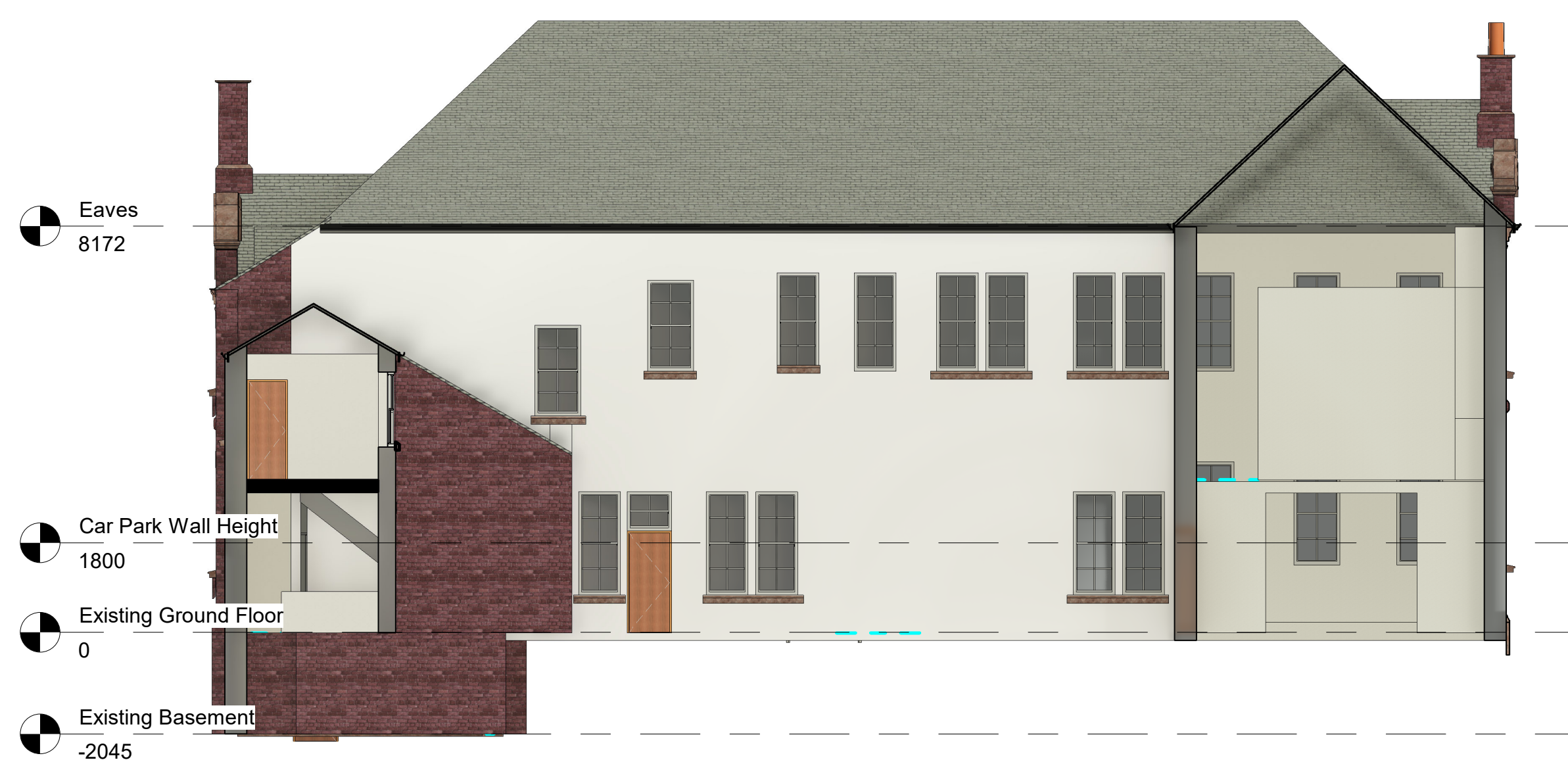
6 Proposed Elevation 6