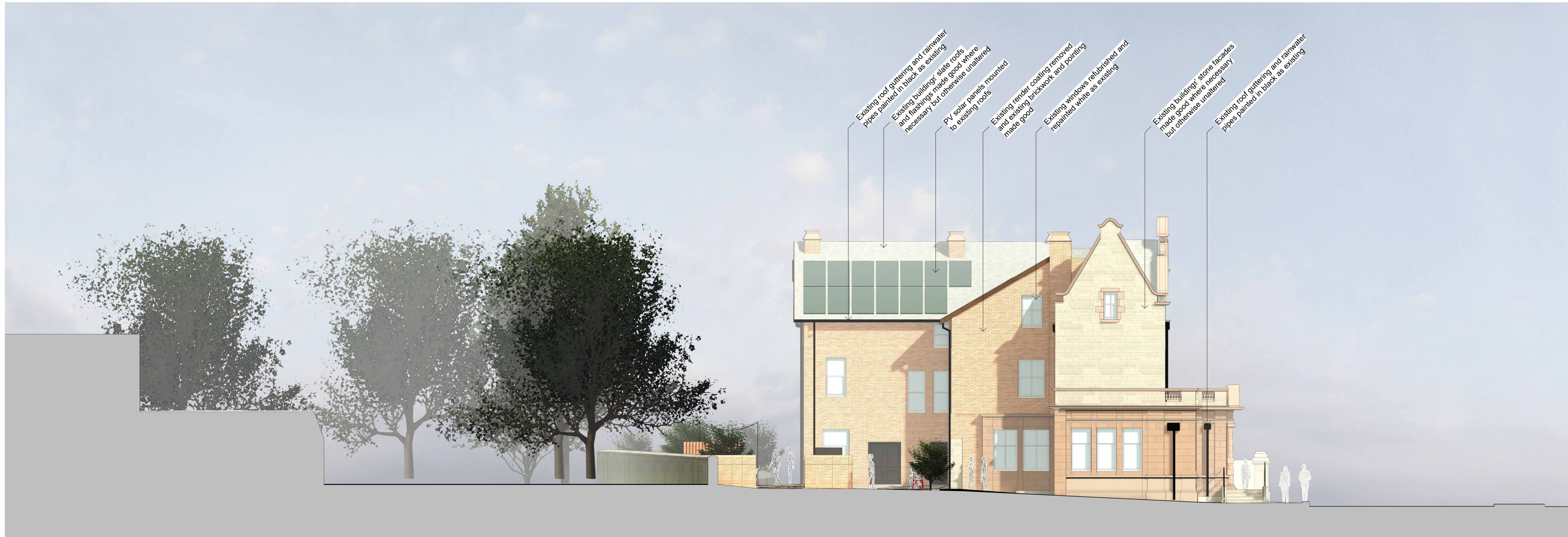
1 Proposed South - East Elevation 1:100