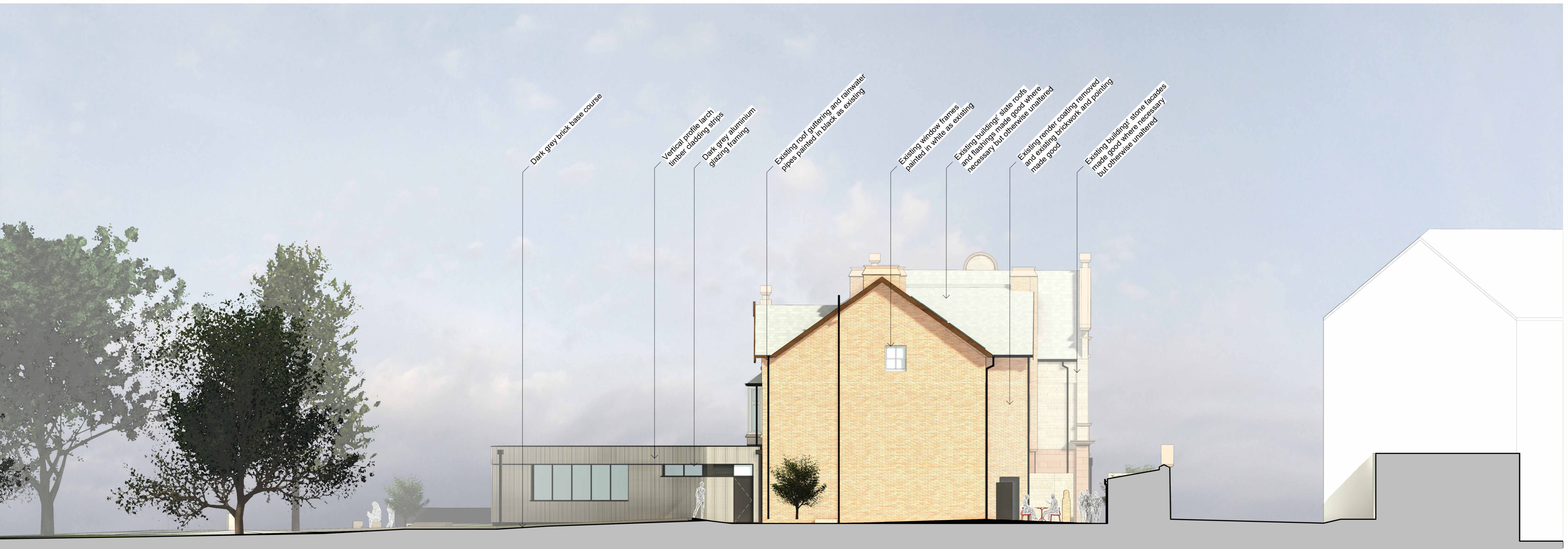
2 Proposed South-West Elevation with boundary wall and trees omitted for clarity 1:100