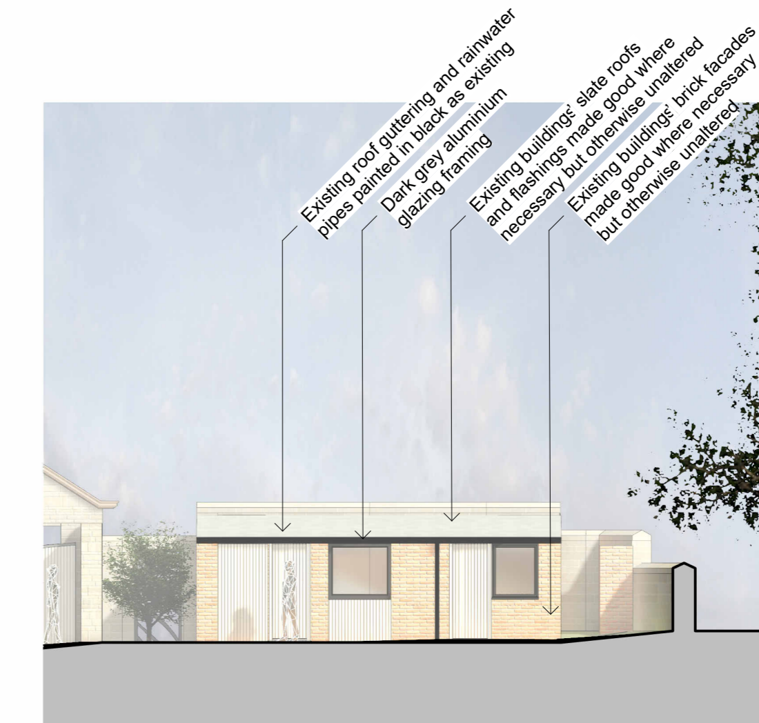
3 Outbuilding Proposed N-W Elevation 1 : 100