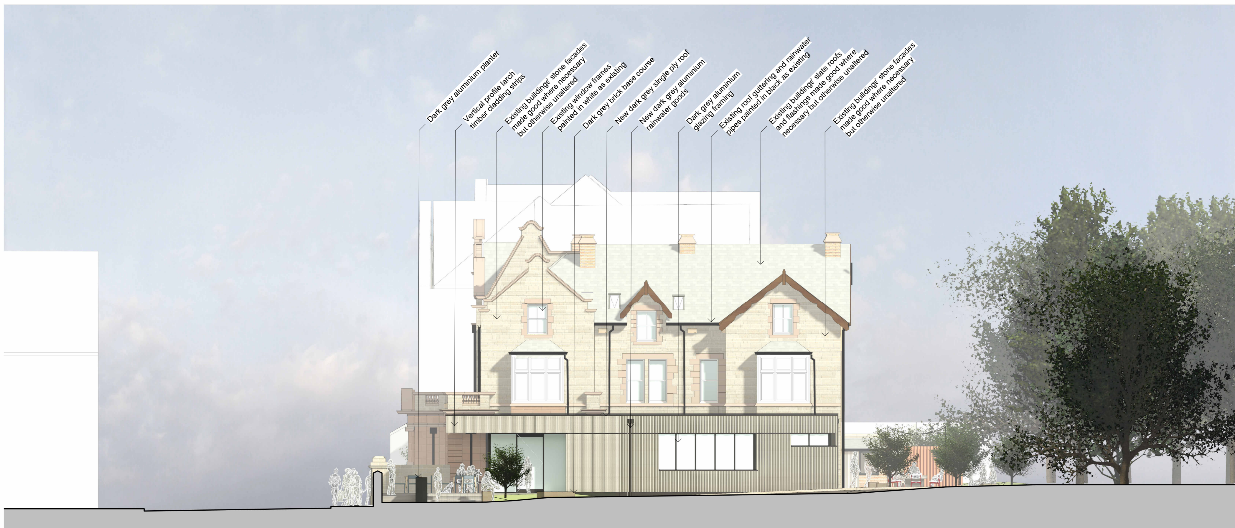
2 Proposed North - West Elevation with boundary wall and trees omitted for clarity 1 : 100