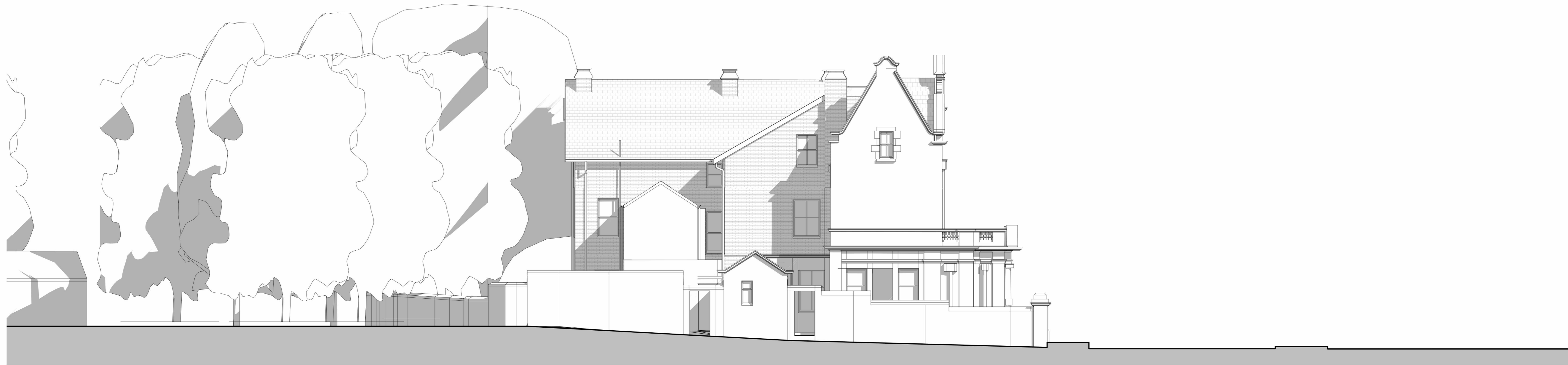
1 Existing South - East Elevation 1 : 100