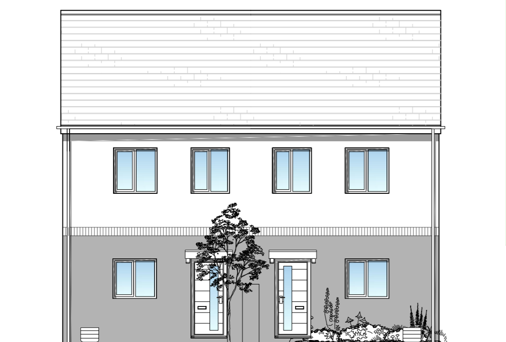
Typical Elevation - Two-tone colour 1:100