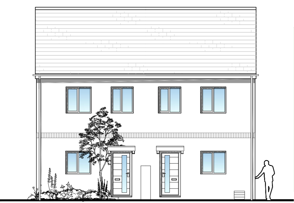
* Typical Elevation - Full white render 1:100