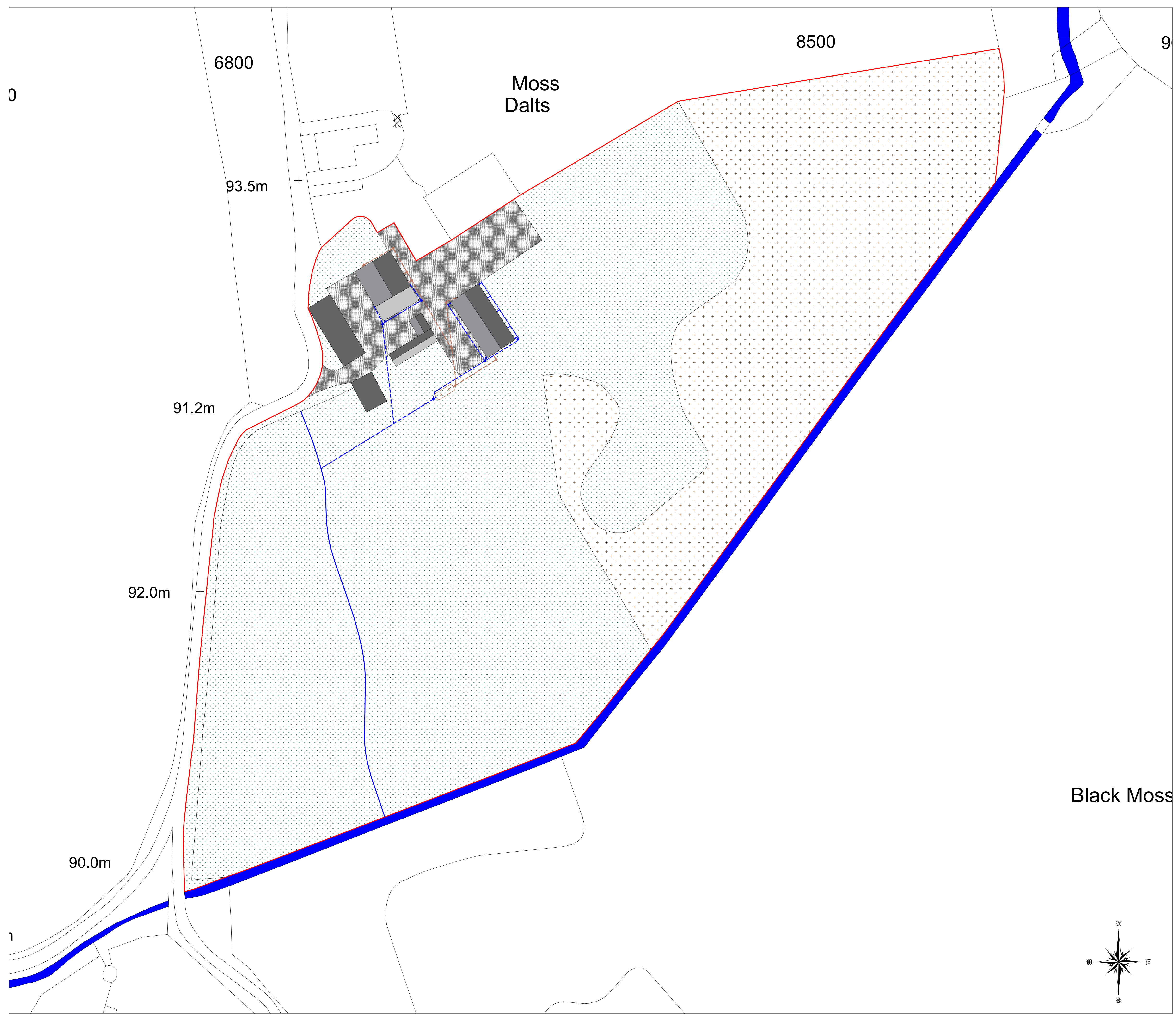
Site Plan 1/2500