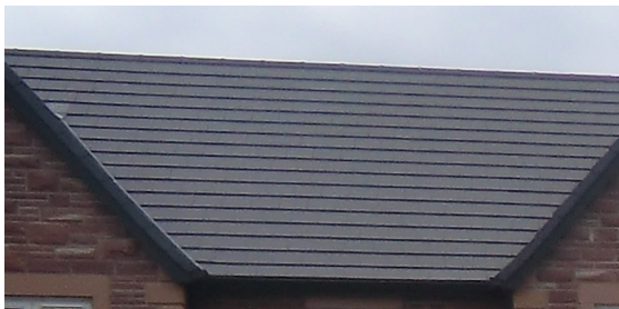
GREY THIN EDGE TILE