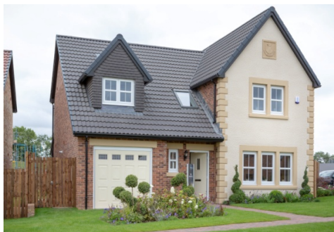
BUFF CAST CONCRETE HEADS AND CILLS