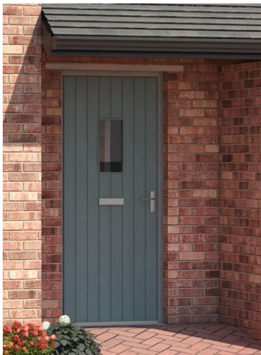
COLOURED COMPOSITE FRONT DOOR