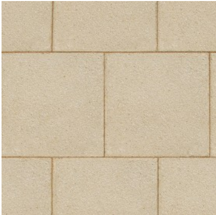
PAVING FLAGS 600X600mm – NATURAL