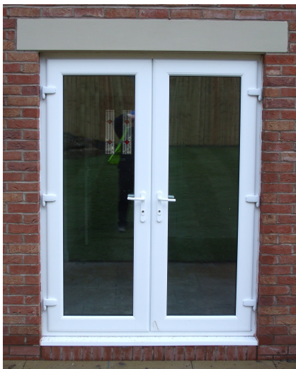
PVCu PATIO DOOR - WHITE