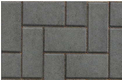
BLOCK PAVIOR – CHARCOAL (DRIVES)