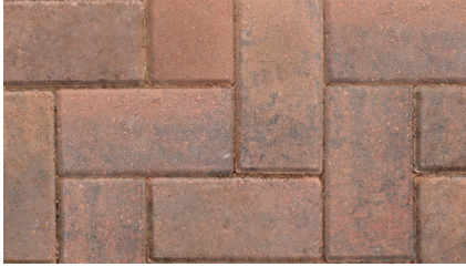
BLOCK PAVIOR – BRINDLE (DRIVES)