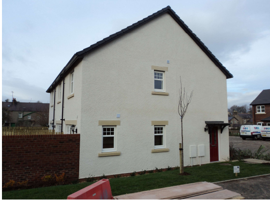
RENDER – COLOUR 'YORK'