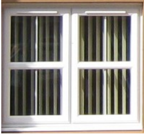
PVCu WINDOW WHITE