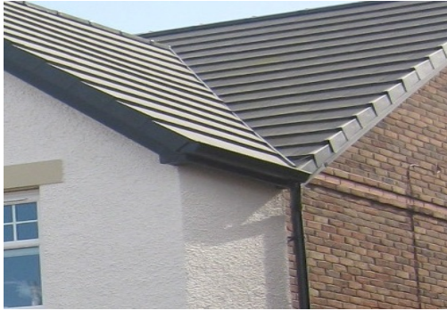
GREY FLAT CONCRETE TILE WITH BLACK PVCu FASCIAS, GUTTERS & DOWNPIPE