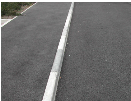
TARMACADAM ROAD & FOOTPATH