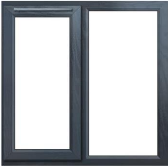
PVCu WINDOW GREY