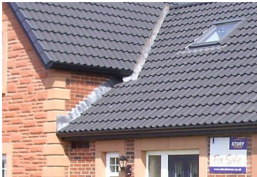
GREY PROFILED CONCRETE ROOF TILE