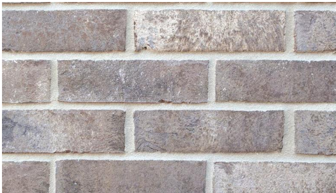
GREY FACING BRICKS