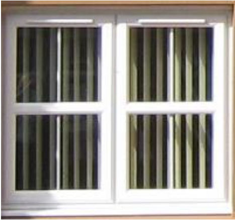
PVCu WINDOW WHITE