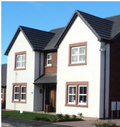
RED CAST CONCRETE HEADS AND CILLS