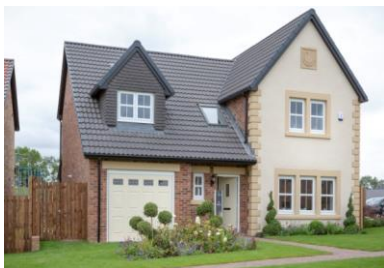
BUFF CAST CONCRETE HEADS AND CILLS