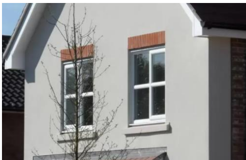
RENDER – LIGHT GREY SMOOTH RENDER