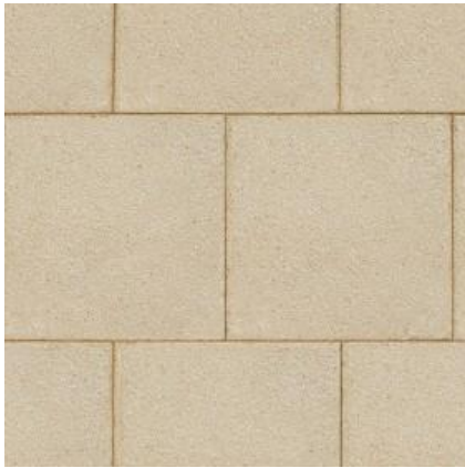
PAVING FLAGS 600X600mm – NATURAL