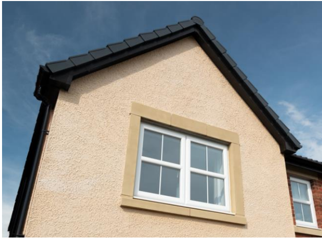
RENDER – COLOUR ‘YORK’