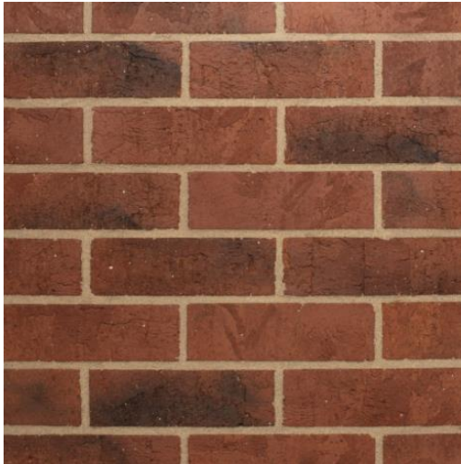
RED FACING BRICKS