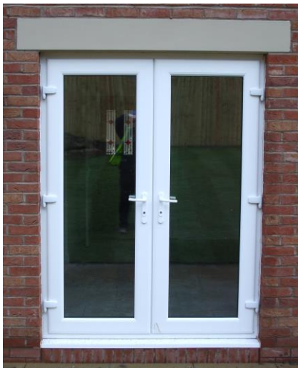
PVCu PATIO DOOR – WHITE