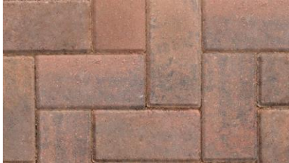
BLOCK PAVIOR – BRINDLE (DRIVES)