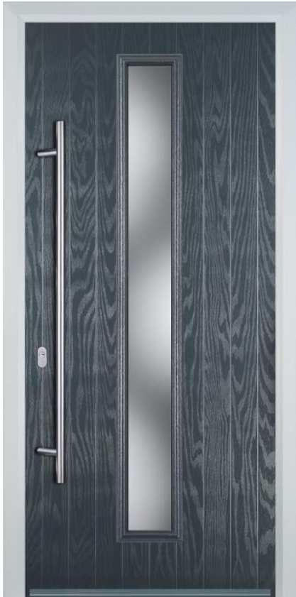
GREY COMPOSITE FRONT DOOR