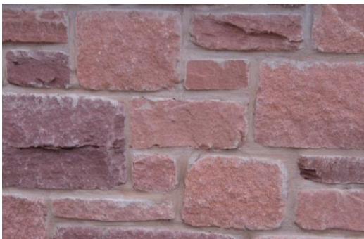
TUMBLED RED SANDSTONE MIX WITH MARIGOLD MORTAR