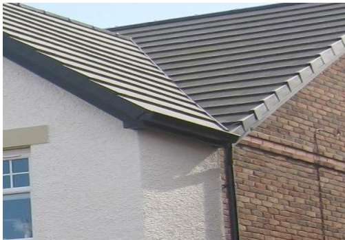
FLAT CONCRETE TILE WITH BLACK PVCu FASCIAS, GUTTERS & DOWNPIPE