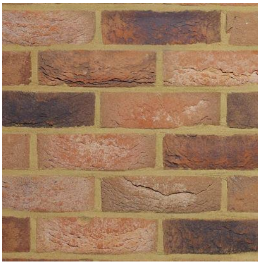
BUFF FACING BRICKS