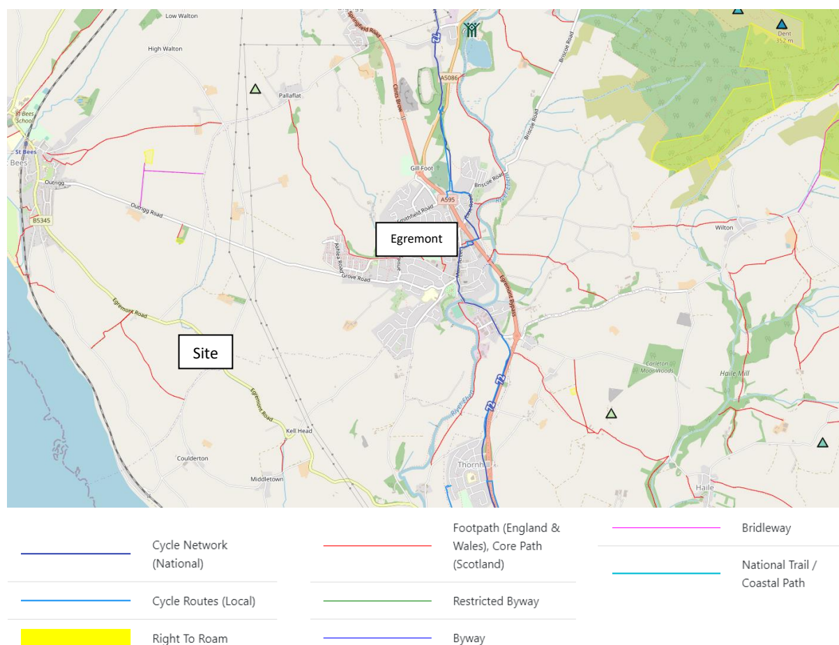
Figure 1 – Footpaths, cycle routes and hills local to the site [4].

The River Ehen ( ref. Figure 1 ) supports the largest viable population of Freshwater Muscles, take a walk along this SSSI river, and spot the muscles or their shells.