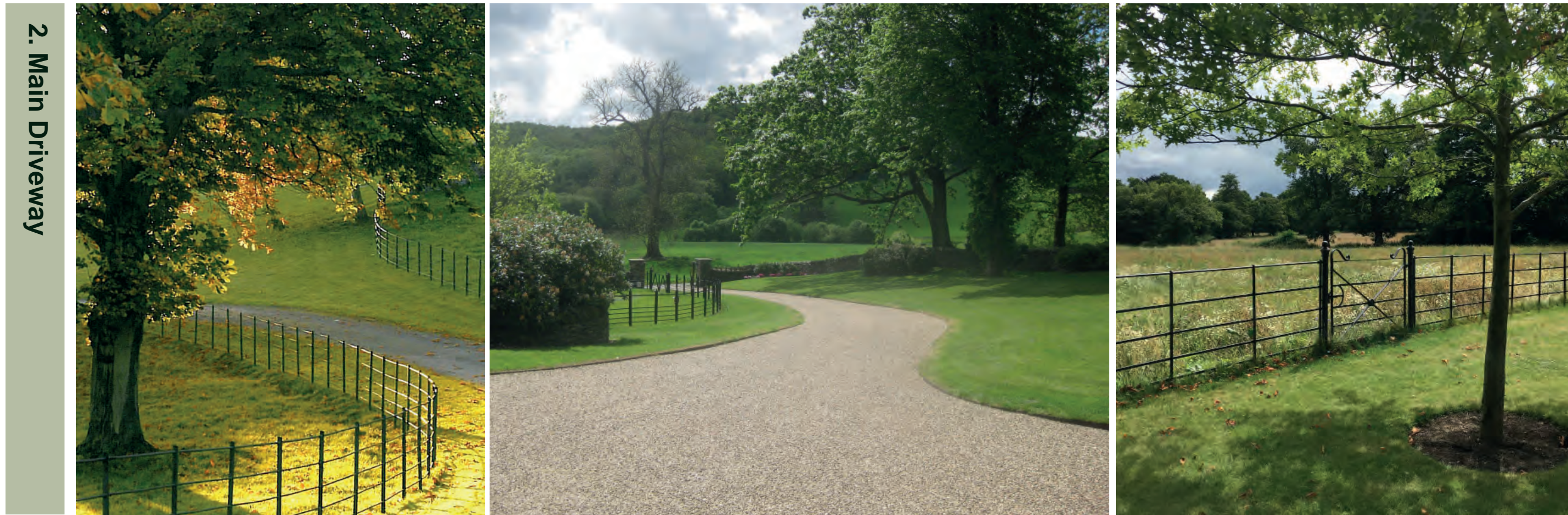
2. Main Driveway

Entrance: A high quality arrangement of local, red sandstone piers, low walls, railings and Holly hedging. Grass verges with semi-mature, landmark trees, e.g. a pair of Red Oaks. A sett threshold demarcates the start of the development. The existing native species hedge along the road is retained and supplemented with metal estate railings. The overall aesthetic is to create a rural, country estate landscape.