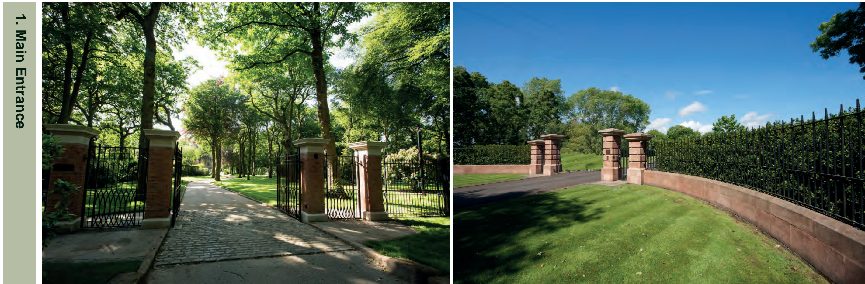
1. Main Entrance

Entrance: A high quality arrangement of local, red sandstone piers, low walls, railings and Holly hedging. Grass verges with semi-mature, landmark trees, e.g. a pair of Red Oaks. A sett threshold demarcates the start of the development. The existing native species hedge along the road is retained and supplemented with metal estate railings. The overall aesthetic is to create a rural, country estate landscape.