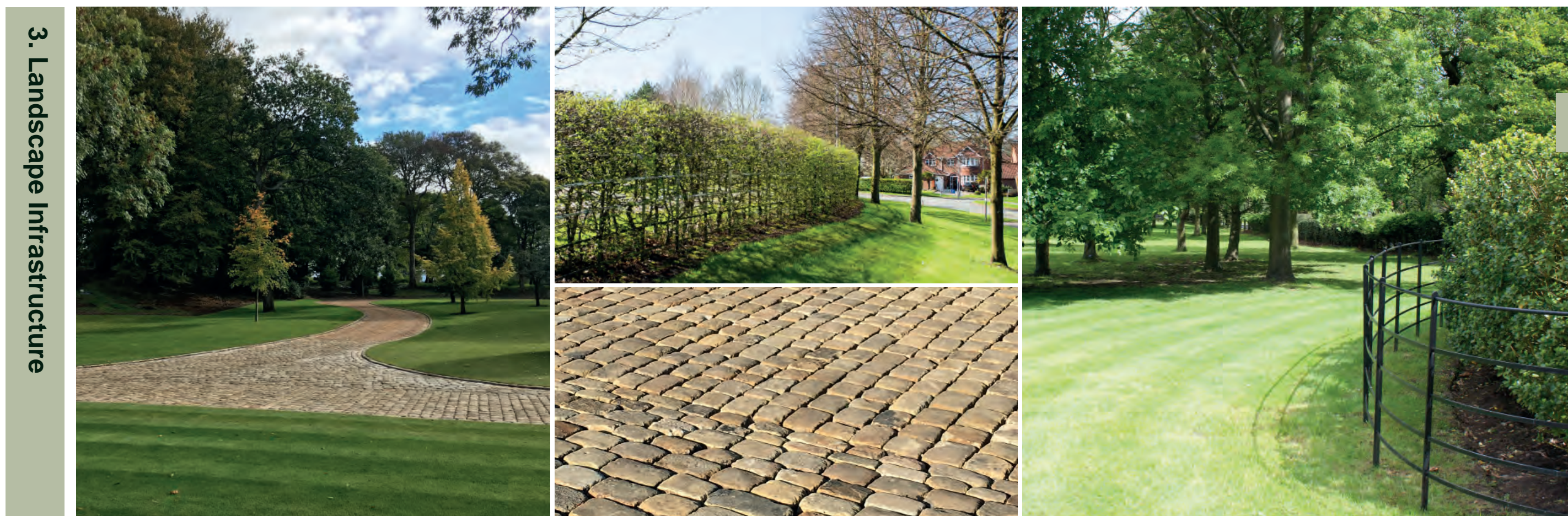
3. Landscape Infrastructure

The main access drive meanders in a gently sweeping path through the site. Wide grass verges with semi-mature trees positioned with space to grow in a traditional manner. Swathes of daffodils would provide seasonal interest. Metal estate railings run in sinuous lines, hedges are used to provide accents. Spurs of tree-lined residential enclaves lead off from the main spine road.